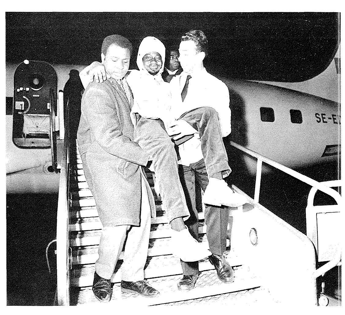
A wounded Biafran arriving in Zurich by an ICRC aircraft, for treatment in a European hospital.