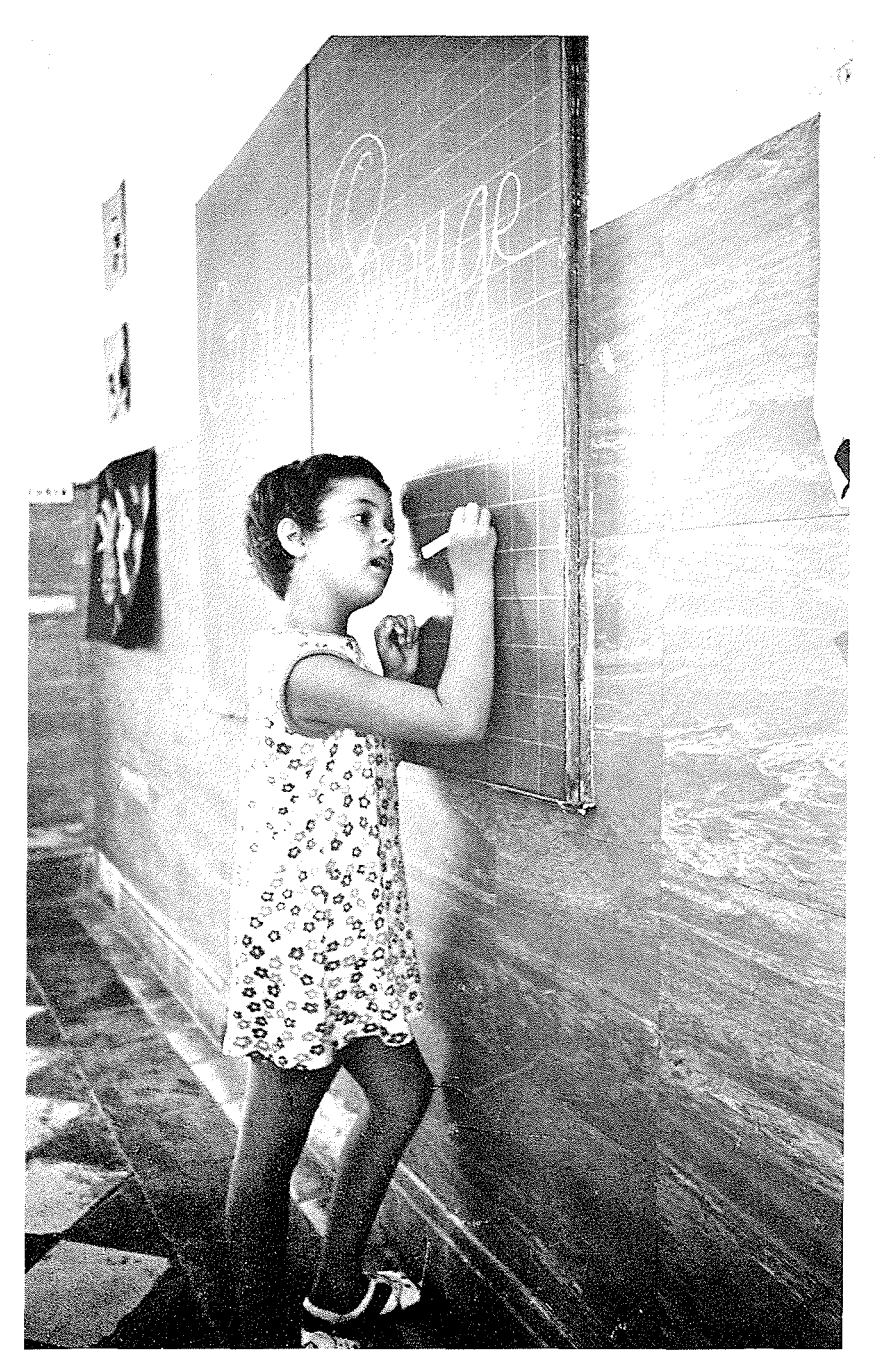
... in Togo