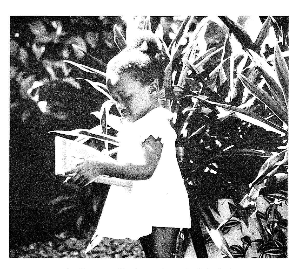
A little girl in Freetown, Sierra-Leone, is interested in the handbook.