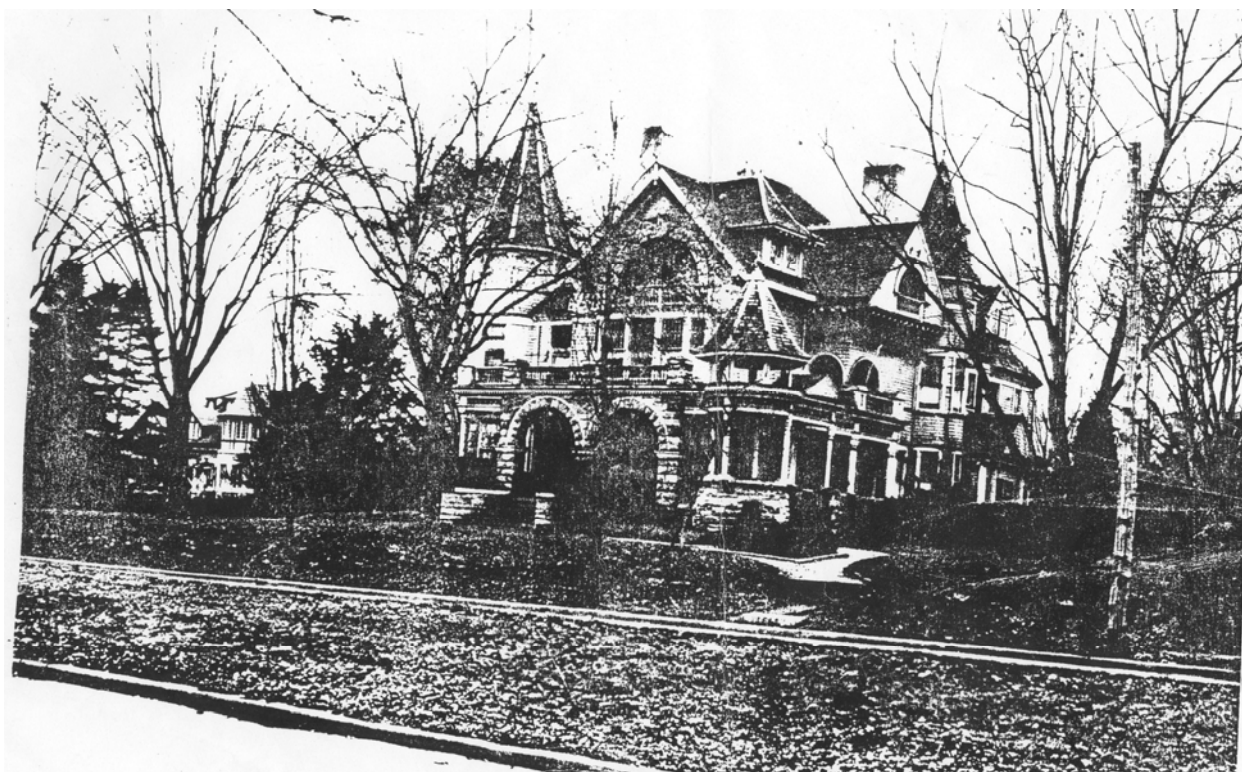
Figure 2: The Hugh E. Graves House on Euclid Avenue which burned ca. 1928. The carriage house at left remains extant.

One of the most ornate Queen Anne style houses built in Bristol was the Hugh E. Graves House completed ca. 1895 facing Euclid Avenue (Figure 2). Known as "The Towers," this dwelling was three-stories in height with two conical towers, inset balconies on the third floor, and a large porch with stone arches on the main façade. The property was the home to Hugh E. Graves a prominent businessman who also served on the city council in the 1880s. A two-story carriage house/servant's quarters was also built as part of this property at 809 Euclid Avenue. This building was designed in the Tudor Revival style with a corner turret and exterior of stone veneer and stucco and half-timbering. The Hugh E. Graves house burned ca. 1928 but the carriage house/servant's quarters remains extant. 4