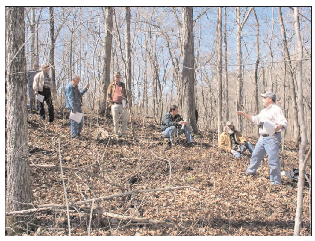
University of Arkansas-Monticello Arkansas Forest Resources Center faculty scientist teaching a wildlife habitat management clinic in Independence County, Arkansas, to landowners as part of ongoing, University of Arkansas-led forest landowner education clinics.