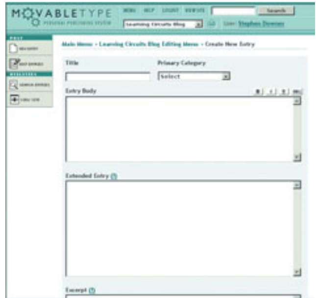
Figure 1. Movable Type

a storm of protest from a blogging community fearful of even greater licensing changes, as typified by Mark Pilgrim's