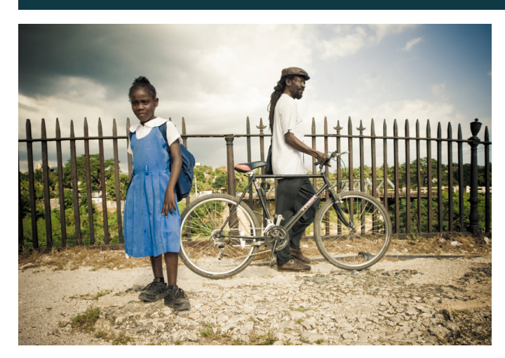
Emmy for new approaches to news and documentary programming, livehopelove.com, interactive web presentation of HIV/ AIDS in Jamaica

Asia Society/Goldman Sachs Foundation Prize for Excellence in International Education for best use of media/technology