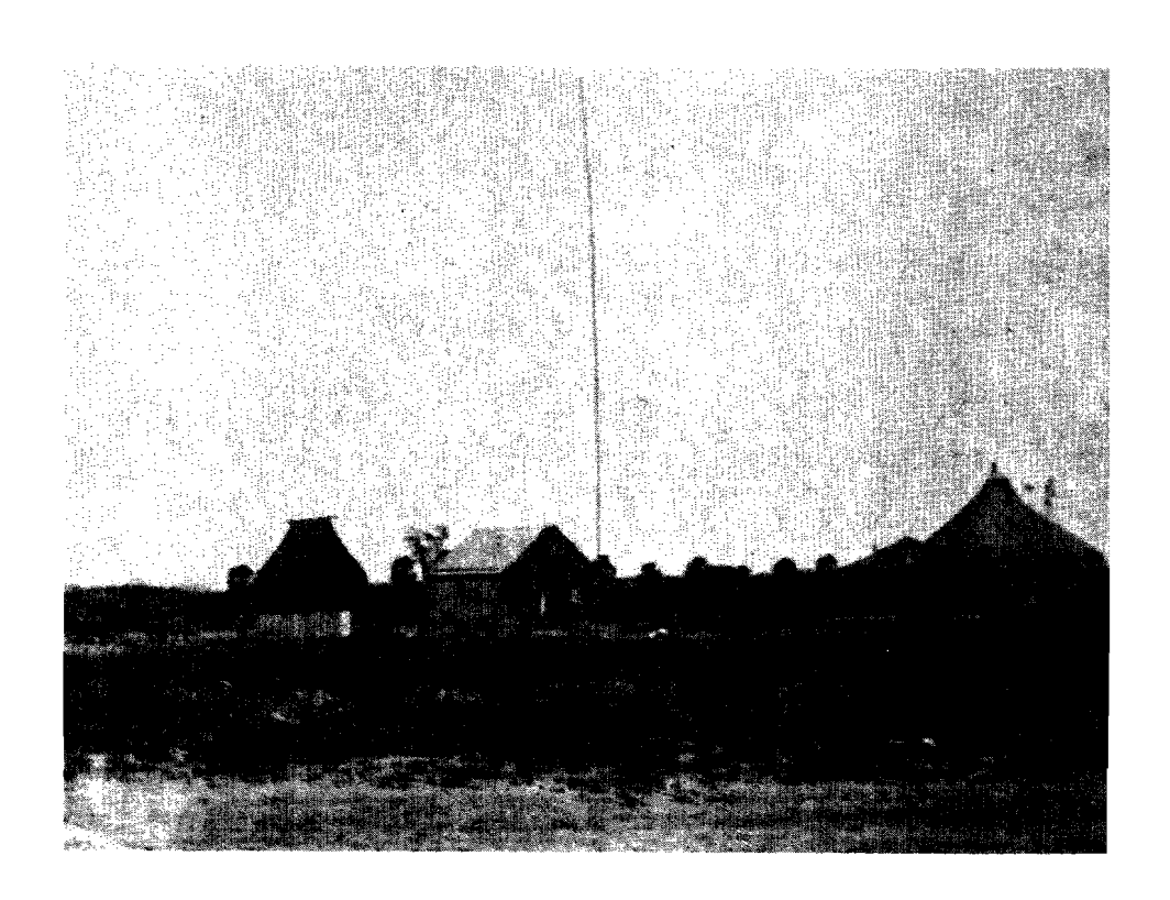
RTU 33, McAllen, Texas. Ford tender, supply tent, receiving station with umbrella antenna, and sleeping quarters.

It was radiotelegraph exclusively, that's all. Of course, it had the other group that could work sema-