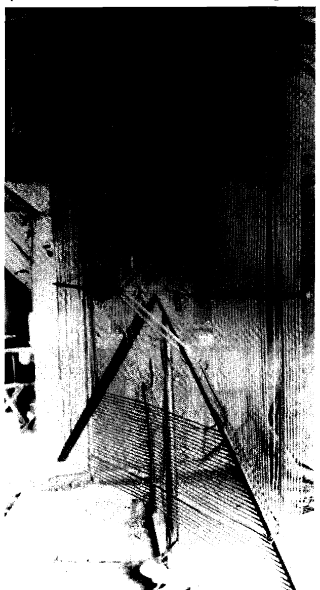
Loop antenna, with 360° dial at base, and map of area on the floor.

The tent was set up right after the equipment came up there. We had a field meter which was hung on the