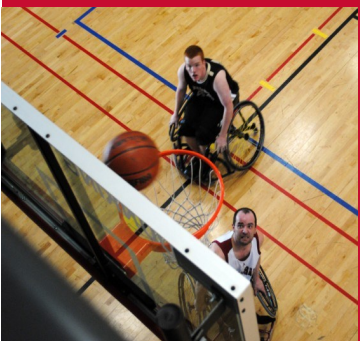
Wheelchair Basketball Tournament