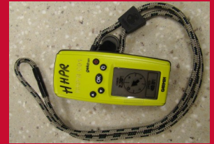
Global Positioning System

hunting game where students locate hidden containers, called geocaches, using their GPS's. This information can then be shared online with other outdoor recreation enthusiasts.