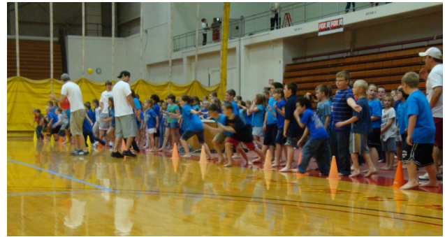
Kansas Kids Fitness Day

Many of you volunteered this spring to help with a multitude of service activities. Here are the estimated numbers of local children we all served! Kansas Kids Fitness Day 961 students, Outdoor Kansas Day 300 students, Middle School Fun Day at the Lake/Park 300 students, Kid's TRYathlon 84 students, Everybody Plays Playground Project 90 students, Elementary Track & Field Meet 2 schools, Elementary Crazy Kids Fitness Day 60 students. 1,500-1,600 + served.