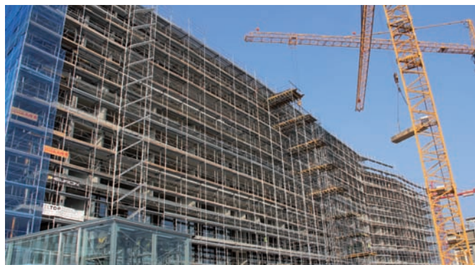
The Edgar de Picciotto Student House.