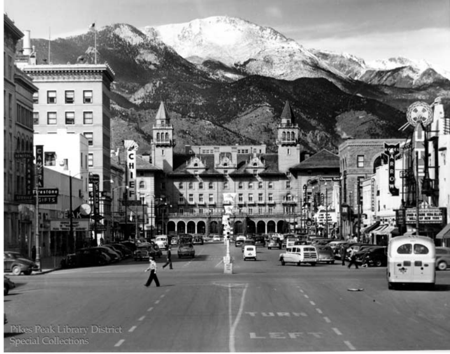
Cover Photo – Downtown Colorado Springs (circa 1952) August 2004