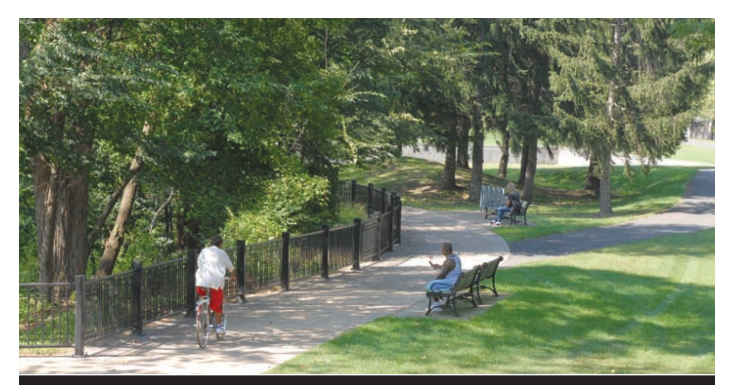
Springfield's new bike path starts near the South End bridge and runs along the Connecticut River. The bike path serves not only as a means of recreation for area residents, but also as a link to downtown amenities such as museums and restaurants.

The Springfield public school system has also created a Parent and Community Engagement Office. Some schools have family liaisons that visit families in their homes, day or evening, to meet with parents and talk about their children's achievement. The schools' aim is to address the lack of parental engagement by designating specific individuals who will be accessible to parents in and out of the school setting.