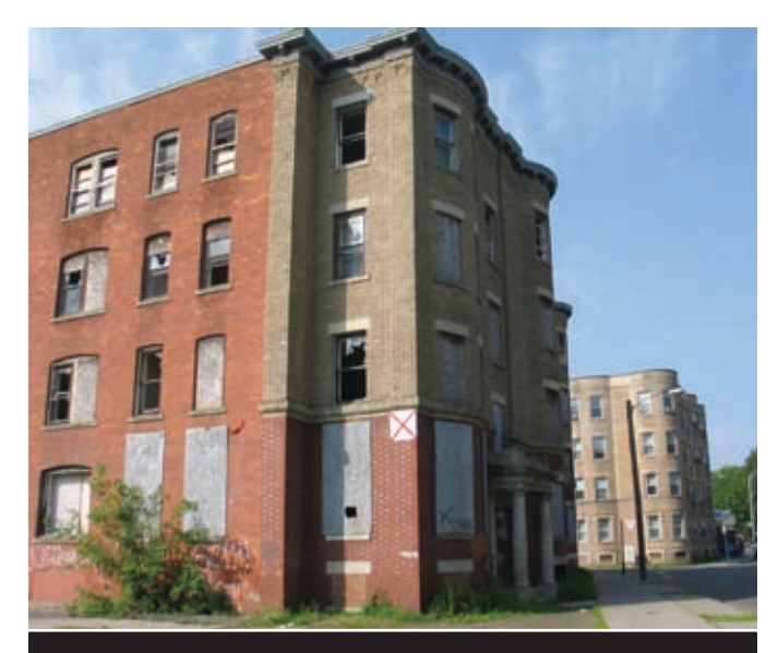
The City of Springfield has slated several properties in its South End neighborhood, where this vacant building is located, for priority redevelopment.