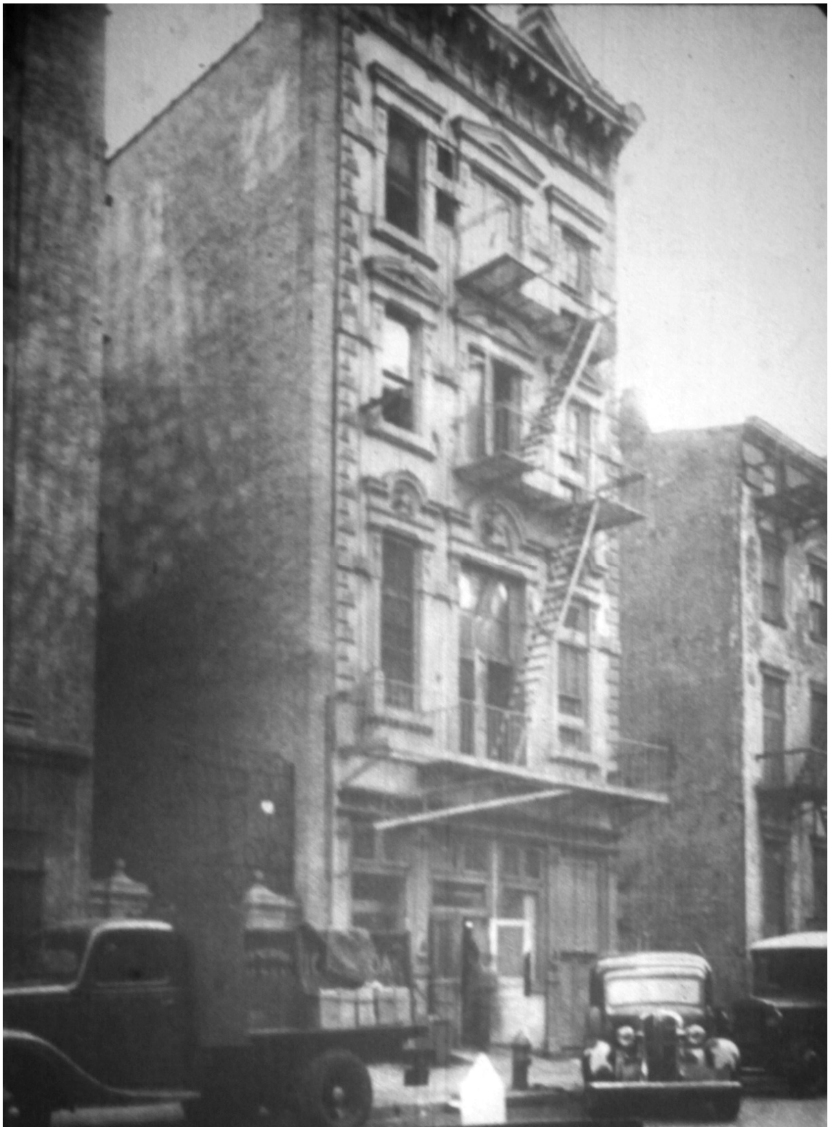
Aschenbroedel Verein (later Gesangverein Schillerbund / now La Mama Experimental Theatre Club) Building