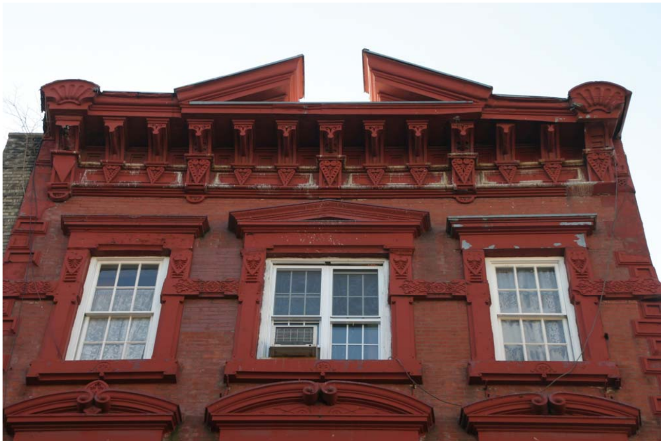
Aschenbroedel Verein (later Gesangverein Schillerbund / now La Mama Experimental Theatre Club) Building, cornice and fourth story