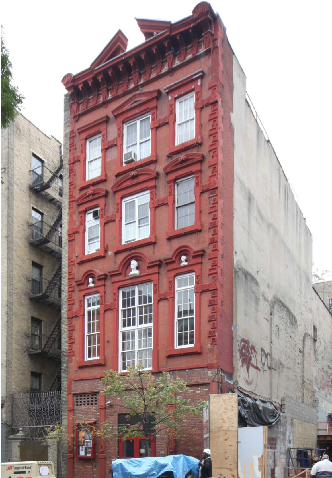
Aschenbroedel Verein (later Gesangverein Schillerbund/ now La Mama Experimental Theatre Club) Building