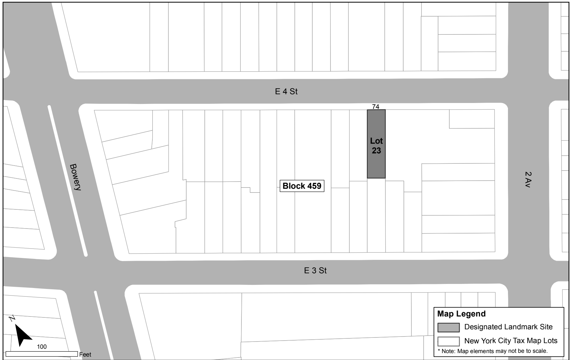
ASCHEBROEDEL VEREIN (later GESANGVEREIN SCHILLERBUND / now LA MAMA EXPERIMENTAL THEATRE CLUB) BUILDING (LP-2328), 74 East 4th Street. Borough of Manhattan, Tax Map Block 459, Lot 23.