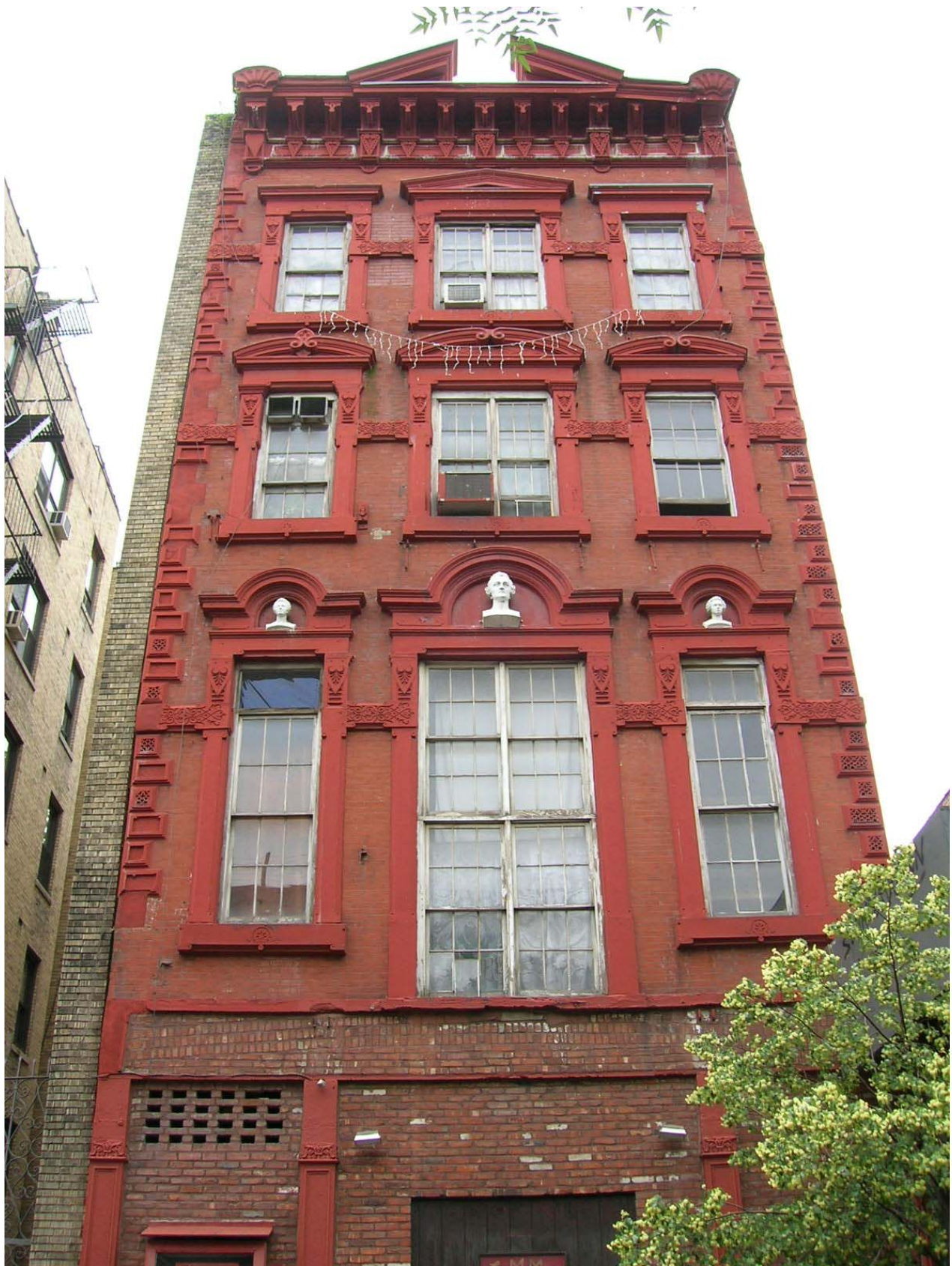
Aschenbroedel Verein (later Gesangverein Schillerbund / now La Mama Experimental Theatre Club) Building