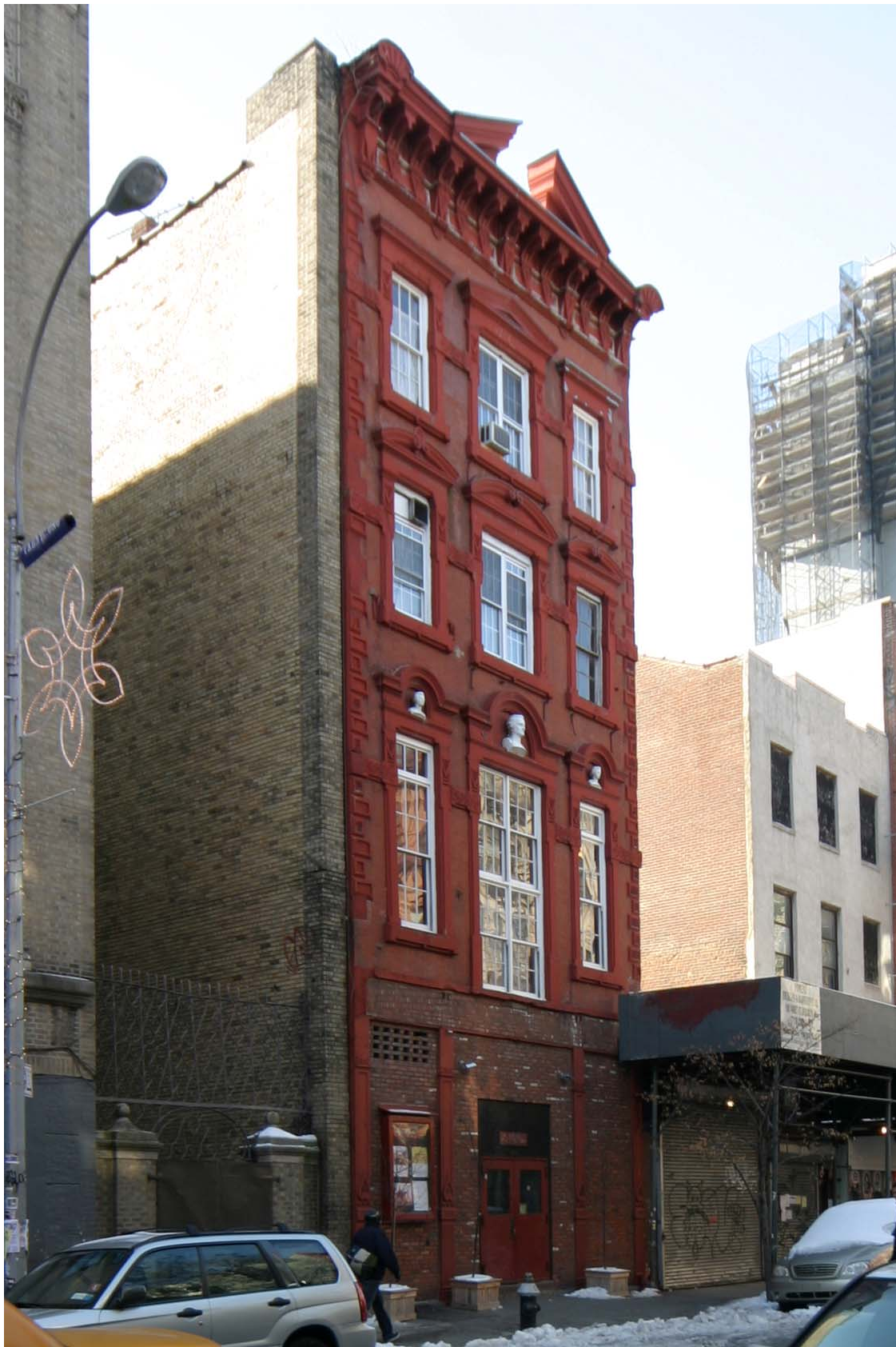
Aschenbroedel Verein (later Gesangverein Schillerbund/ now La Mama Experimental Theatre Club) Building