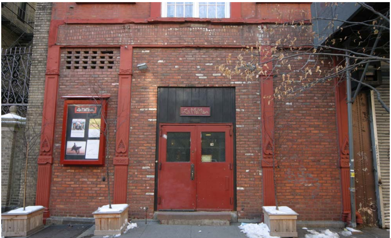
Aschenbroedel Verein (later Gesangverein Schillerbund/ now La Mama Experimental Theatre Club) Building , ornamental detail and ground story