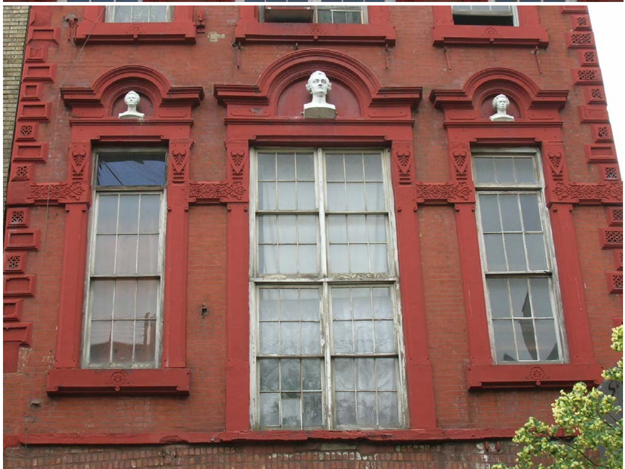
Aschenbroedel Verein (later Gesangverein Schillerbund / now La Mama Experimental Theatre Club) Building , third and second stories