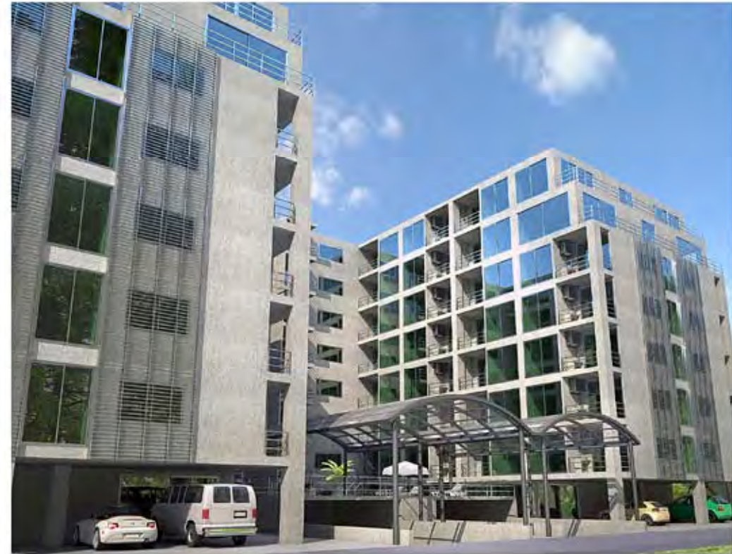
Pratumank Soi 6, Pratumank Hill, South Pattaya