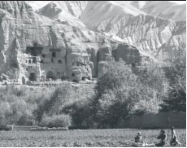
Bamyan Valley, Afghanistan

Representatives of governments, non-governmental organizations and the tourism industry from some 15 countries, who attended the informal dialogue, discussed the possibility of working together so that the complexities of tourism would be considered more actively in the nomination of World Heritage sites. They called on the World Heritage Centre to play an even greater role in facilitating the participation of the tourism industry in the site-management planning process, and suggested that the World Heritage Centre liaise between the ministries of tourism and the tourism industry to make the complex problems of ecotourism easier to understand.