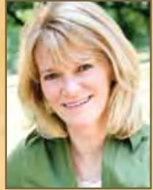
Martha Raddatz ABC News