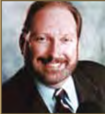
2012 HONOREE JIM BOHANNON

RTDNF recognizes exceptional successes made by television and radio journalists, and news executives who have made significant contributions to the protection of First Amendment freedoms.