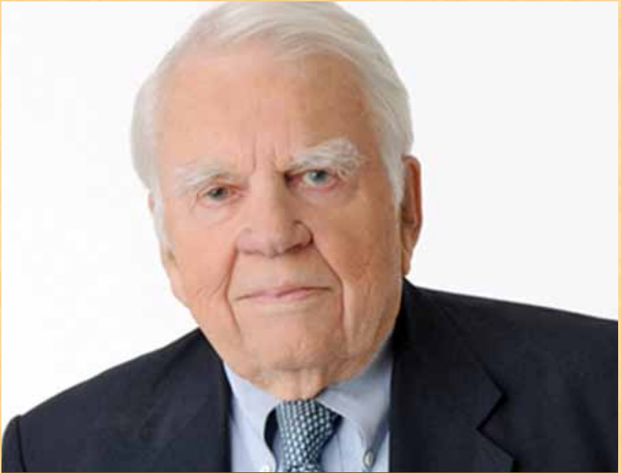
ANDY ROONEY 1919 – 2011

ACHIEVEMENT AWARD FOR JOURNALISM EXCELLENCE