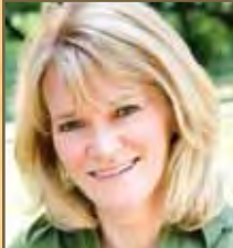
2012 HONOREE MARTHA RADDATZ

Named for the late Broadcasting & Cable senior correspondent, this award is presented annually to a radio or television journalist or news executive whose work, through high standard and significant achievements, embodies the spirit of the First Amendment and its free-press principles.