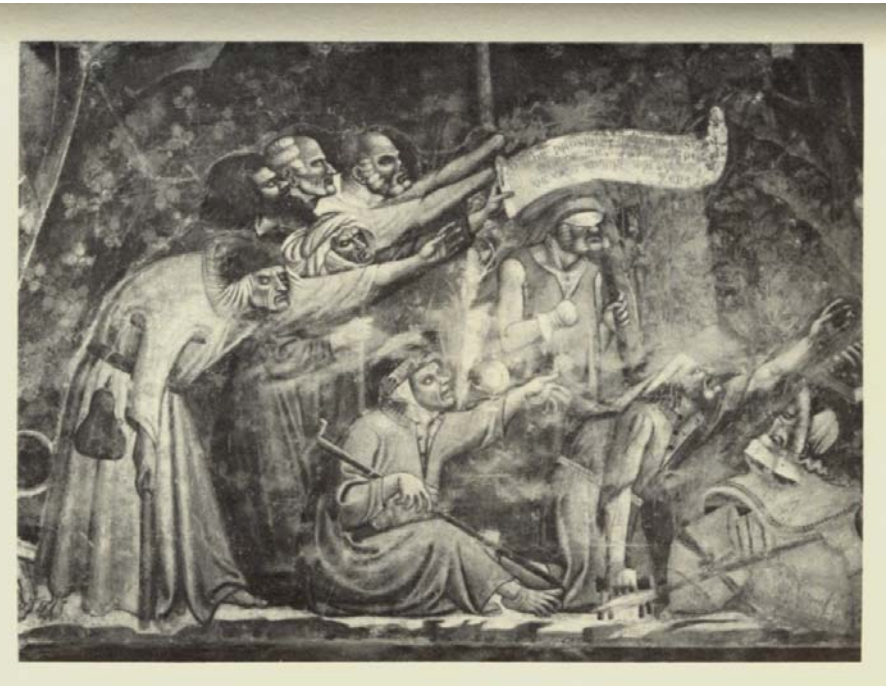
Fig. 11. The Sick and Lame Yearning for Death. Detail of Figure 1.

streets infested with human/animal wastes, garbage and butchered animal remains. Crowded living conditions as well as poor construction of houses (using wood instead of brick) increased susceptibility to an infection. By the time 15<sup>th</sup> century rolled around, sanitary measures (e.g. decreased filth on the street) had been carefully implemented and were showing their effectiveness.