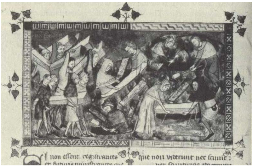
Figure 2: Gilles li Muisis, Burial of Plague victims in Antiquitates Flandriae ab anno 1298 and annum 1352. Brussels, Bibliotheque Royale, MS no. 13076, fol. 24v (Polzer, 1982)

With either hypothesis, it was the globalization of trade and increased contact with various regions that allowed the plague to propagate across Eurasia from its source.