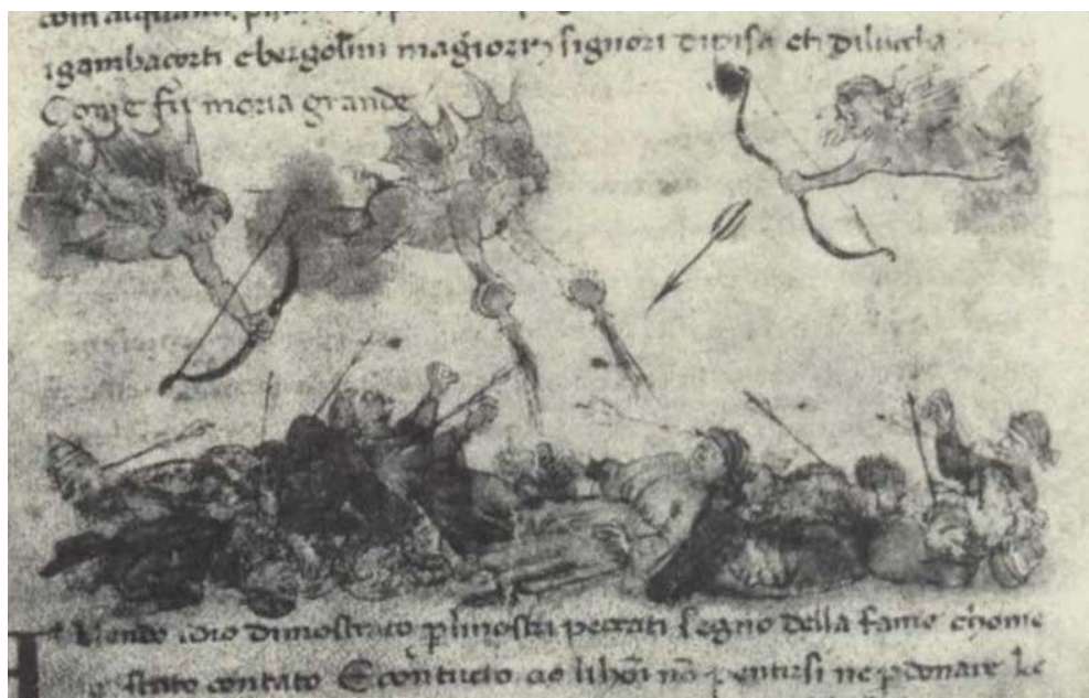
Figure 4: Giovianni Sercambi, The Black Death of 1348 in his Chronicle , fol. 49v (Polzer, 1982)

The rival school (Montpellier) suggested deadly vapors causing the illness came from the south and were multiplied within the air of a given city due to the way the three planets had been lined (Palazzotto, 1973). Thus they advised that doors and windows facing the north be opened (Gottfried, 1983). A common belief of the time was that warm air, common in the summer, caused the pores on the skin to open (the season coincides with the reproductive cycle of the flea). Open pores on the skin increased access of corrupted air to the internal organs, and were to be avoided. Baths were also thought to open up pores (Gottfried, 1983).