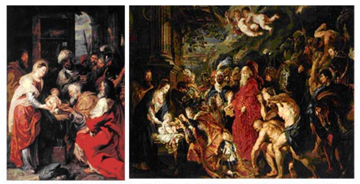
Figure 1 and 2. The 1609 and 1629 versions of 'The Adoration of the Magi' by Rubens. (Gronigen; Prado, Madrid).