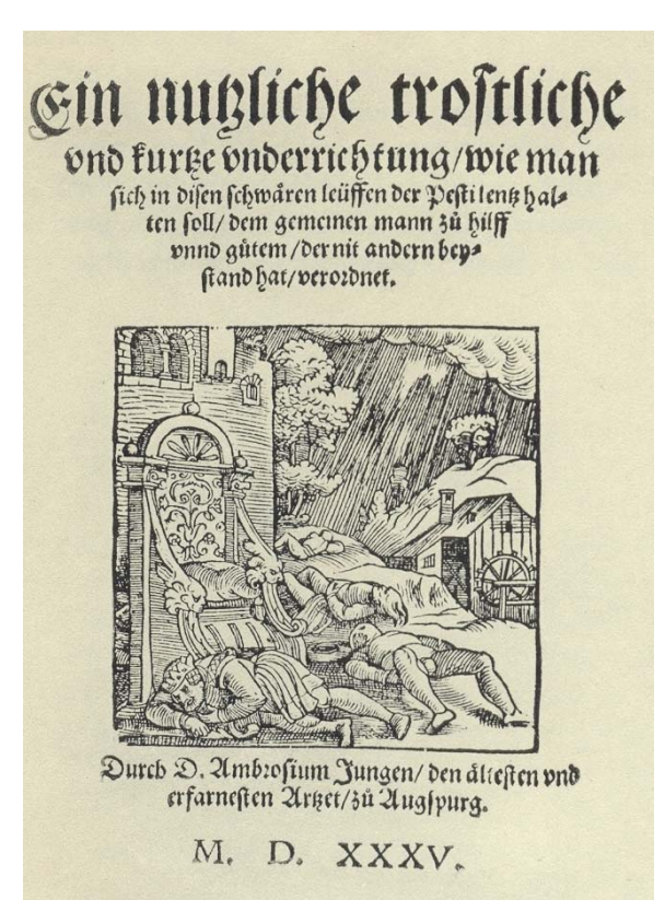
Figure 1: Pestilence: title page of 'a brief, practical and comforting treatise' (1535) by Ambrosius Jung (from Smith, 1948)