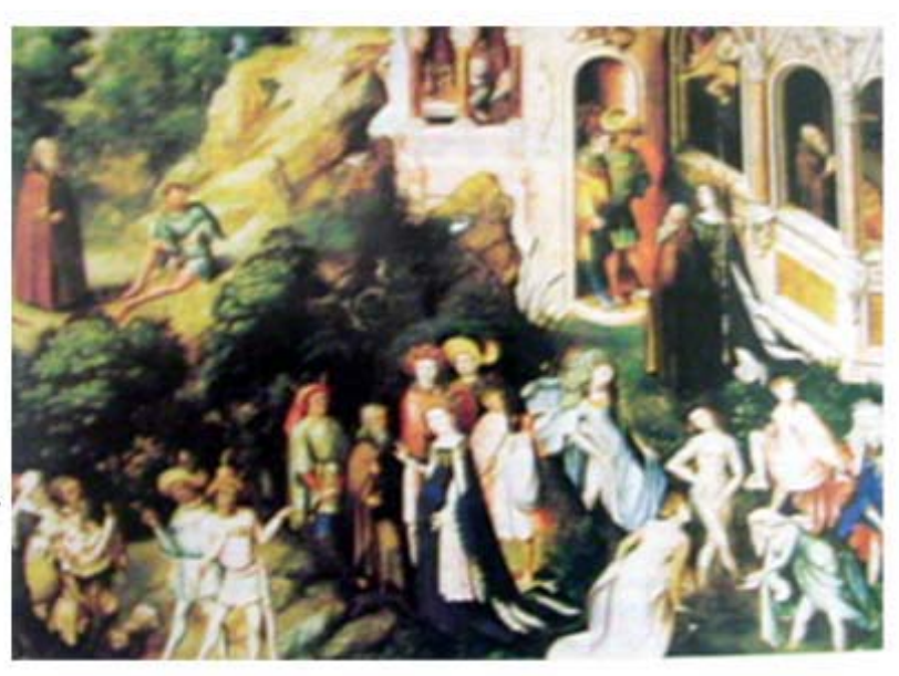
Figure 4. "The Temptation of St. Anthony". Anonymous, mid-15th-16th ce.

Figure 5. Detail of "The Temptation of St, Anthony". (Escorial museum, Madrid). Rheumatoid arthritis deformities are seen in the figure of a crippled, middle-aged, bearded beggar, holding a staff and being supported by another person. Notice the ulnar deviation and flexion of the proximal interphalangeal joints. The beggar's knee is flexed and rotated.