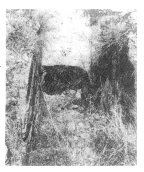
Entrance to Amrit stadium.

The present condition of the stadium, as it appears now, gives cause for concern due to lack of maintenance and the collapse of a part of the rocks and earth on the upper north side of the steps due to rain and floods. But the forms of the stairs are still clear and can be revealed completely if we remove the grass which covers a part of them. We were unable to reveal the stadium floor since trees