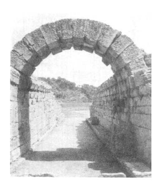
Entrance to the stadium of Olympia.

the Olympic stadium in Greece were not discovered entirely until the excavations of 1937.