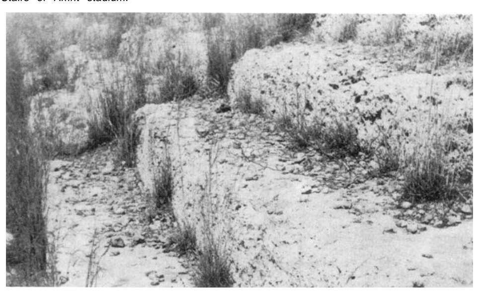
Stairs of Amrit stadium.

Contenau traces the construction of the temple to the eighth century B.C.<sup>33</sup> and Dunand traces it to the seventh century B.C.<sup>34</sup> If this temple, in its final form, dates from the epoch suggested by these two scholars, then, in principle, it has existed since the