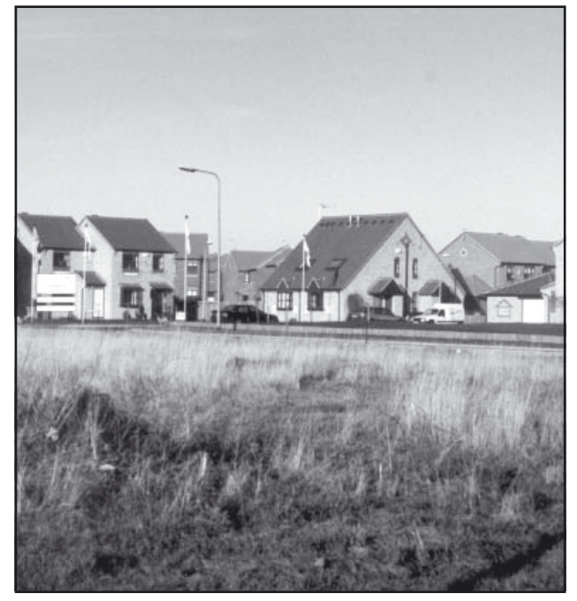
New housing at Kingswood