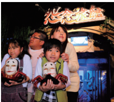
★ Experience ghost photography in the attraction Onnen Ryokan (Haunted Inn)

Shoot, shoot and shoot some more, at targets that appear on four screens. Get fired up and come out refreshed. Actual bullets will fly. After you finish four stages, there's a final stage. The excitement never ends.