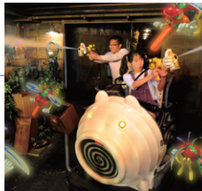
★ Katori Daisakusen (Mosquito Repellent Battle), an attraction you'll never find in any other country!

The standard greeting in NAMJATOWN is "Namjaraaah."