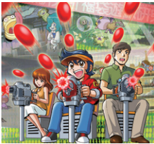
★ Mirai Yuugi Ganganer (Future Sport Ganganer), a real shooting attraction