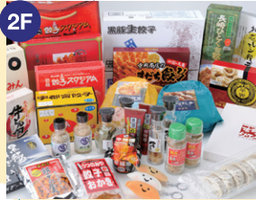
A Najavu Room *