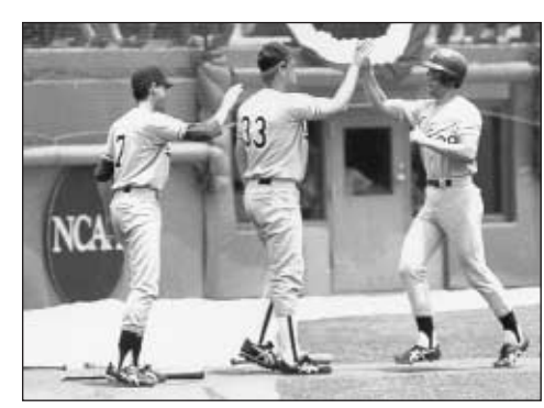
The 1989 Villanova Wildcats were just one game away from earning a trip to the College World Series.

CHAMPIONSHIP Miami 4 Villanova 1 (Miami Wins Regional)