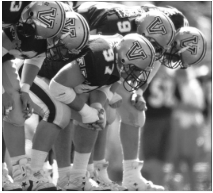
Villanova and archrival Delaware were Yankee Conference co-champions in 1991. Villanova registered two conference championships and four NCAA playoff appearances during its nine years as a member of the Yankee Conference.