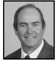
Art Briles 2003-