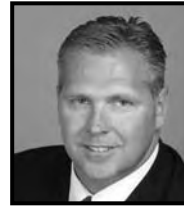
Dana Dimel 2000-03