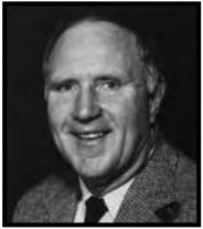
Jack Pardee 1987-89