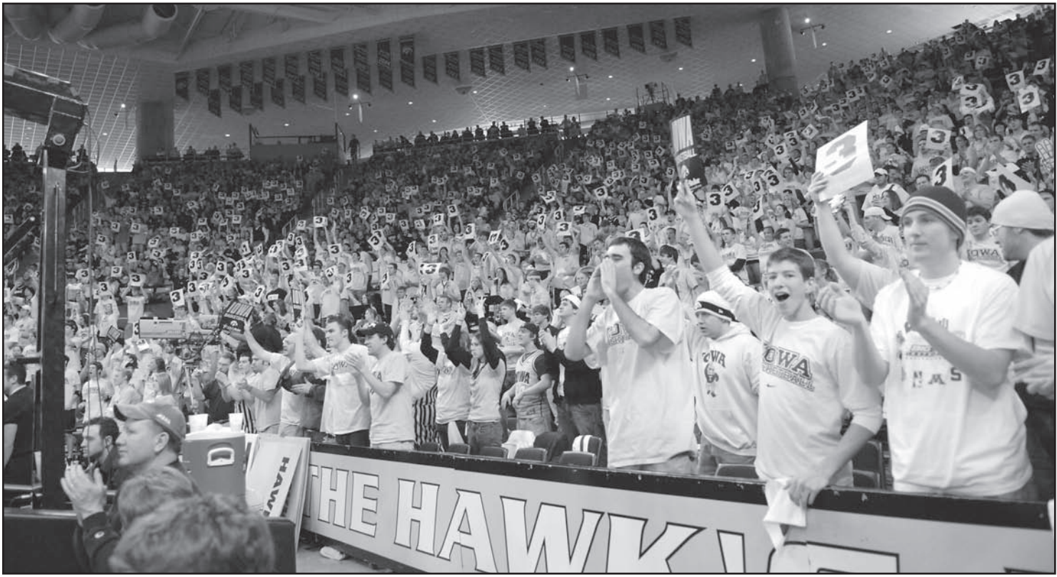
All eyes are on the Hawkeyes when lowa is in action in Carver-Hawkeye Arena. lowa is 31-2 in Carver-Hawkeye Arena over the past two seasons, including a 17-0 mark in 2006. The Hawkeyes annually rank among the national leaders in home attendance.

THE UNIVERSITY OF IOWA: ONE OF THE NATION'S VERY BEST