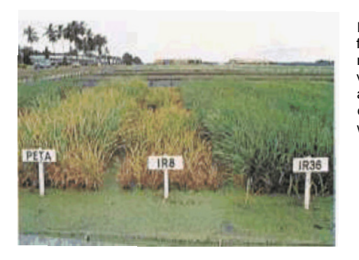
In tests at the IRRI farm to determine reactions to BPH and virus diseases, Peta and IR8 were badly damaged, but IR36 was not.

1970 were resistant to BB, SB, and BPH, but were susceptible to GLH, RTV, and GSV.