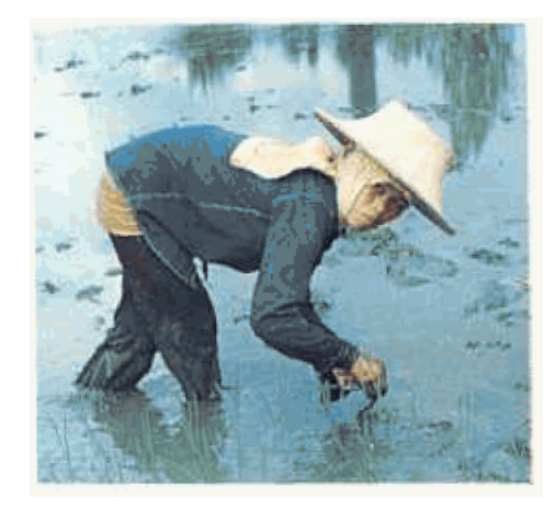
Above:Transplanting in Thailand. Right: Using a small threshing machine in India.