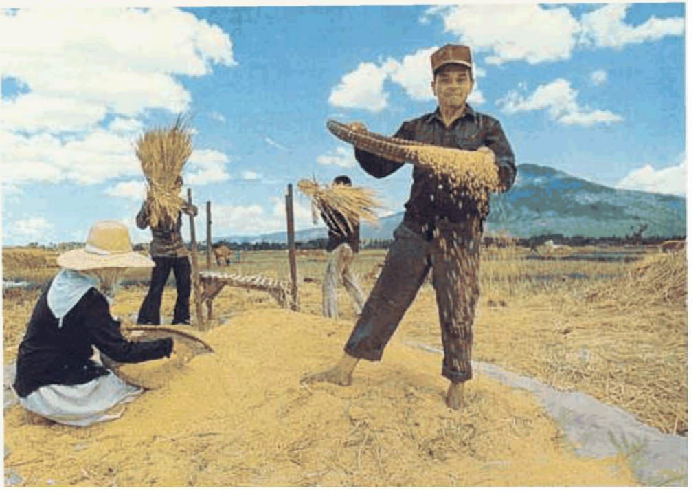
Hand-threshing in the Philippines.

technologies are helping to improve and stabilize the lives of these people.