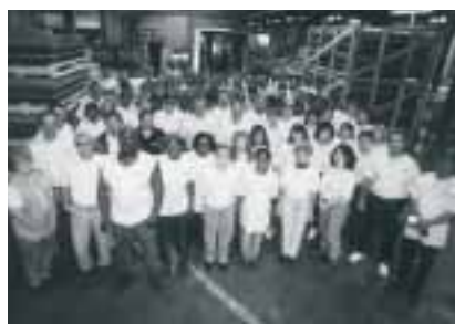
Also wearing jeans to work on October 8 were Milcor employees in Lima, Ohio.