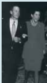
1999 Tour de France Champion Lance Armstrong and Komen Foundation founder Nancy Brinker.

M ore than 2,300 guests attended the Komen National Awards Luncheon in Dallas this past October. Themed A Cure for All Time , the 17th annual event honored those who have made great strides in the fight against breast cancer over the past year.