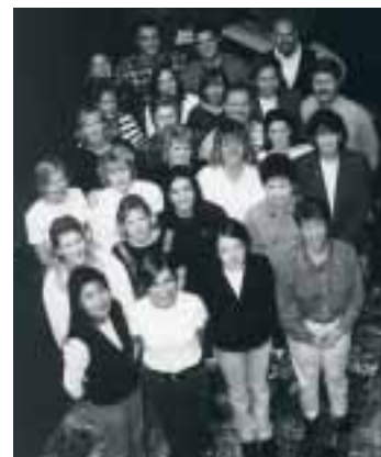
The employees of GE Capital-Simulflite, located at Dallas-Fort Worth International Airport, participated in Lee National Denim Day™.

N early 1.5 million Americans wore denim to work on October 8, 1999, in celebration of the fourth annual Lee National Denim Day™, a special day on which more than 18,000 companies from all across the country allowed their employees to wear jeans to work in exchange for a $5 donation in the fight against breast cancer.