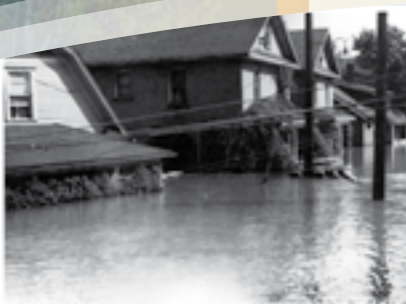
Photo: Columbia wetlands near Harrogate.

Both countries finalize water storage site selection and continue negotiating the CRT.