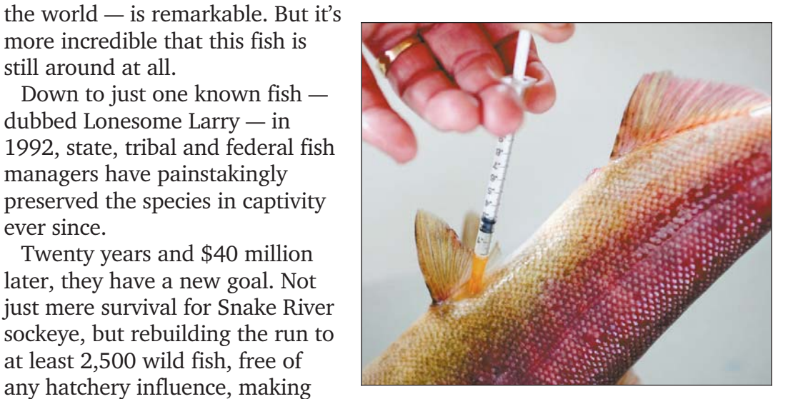
A Snake River sockeye gets an inoculation at the Eagle Hatchery, near Boise.