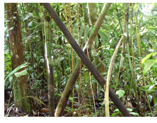
Spears left by uncontacted Indians as a message to bar outsiders from entering.

Other companies involved in the Napo-Tigre area are Repsol-YPF, ConocoPhillips, the Colombian state oil company Ecopetrol, and the Brazilian state oil company Petrobras.