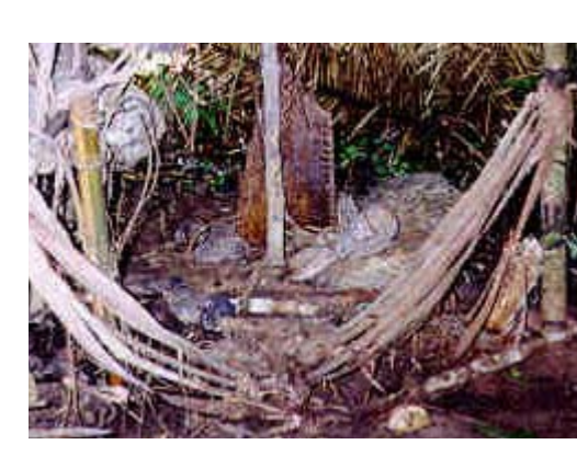
Hastily abandoned malocca, Rio Pardo, Brazil