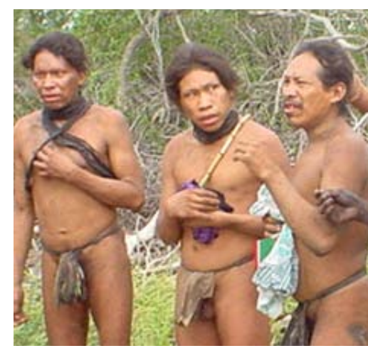
A group of Ayoreo-Totobiegosode Indians first contacted in 2004, Paraguay.

Some Totobiegosode were spotted towards the end of 2008, apparently fleeing the destruction of their forest. On one occasion a group of eight or nine men were seen.