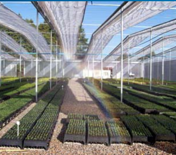
Riparian Forest Programme / Government of Paraná / Brazil