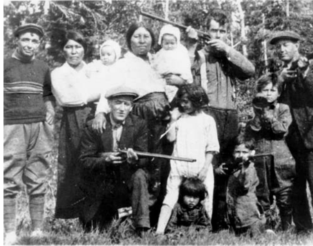
Residents of Young's Point - circa 1930