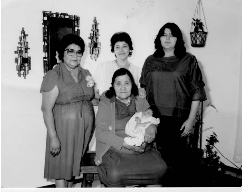
Five Generations of Ghostkeepers - 1985