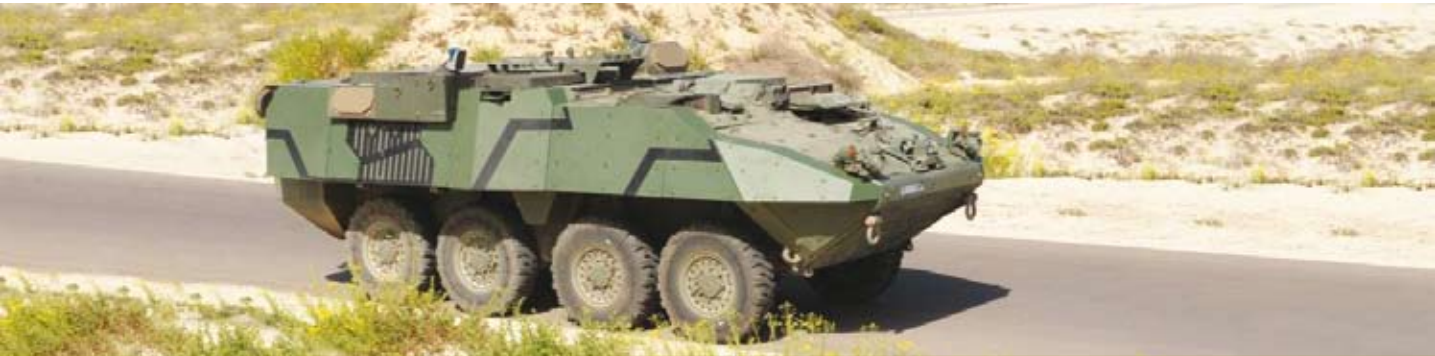
Trophy - MV