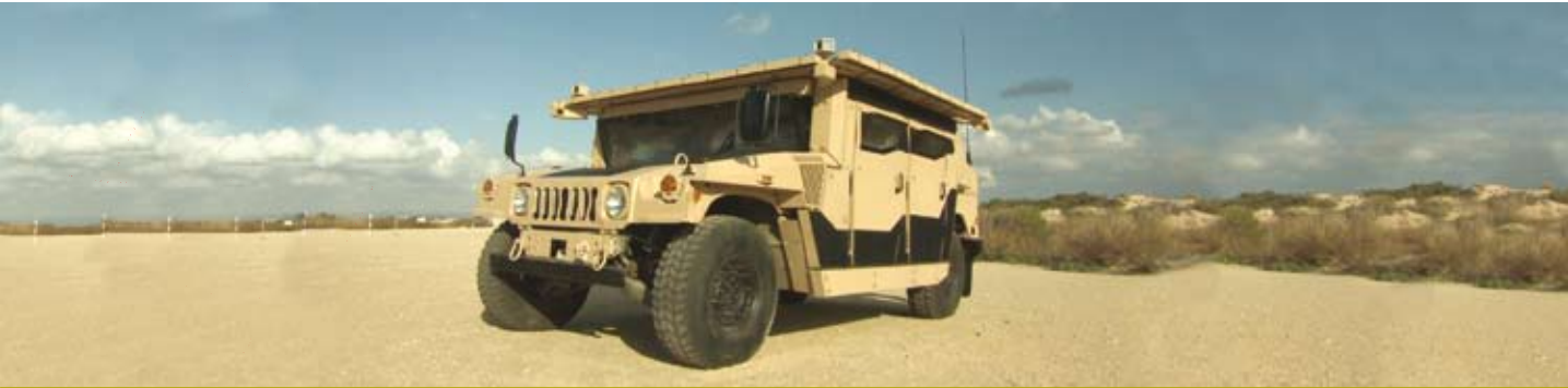
Trophy - LV