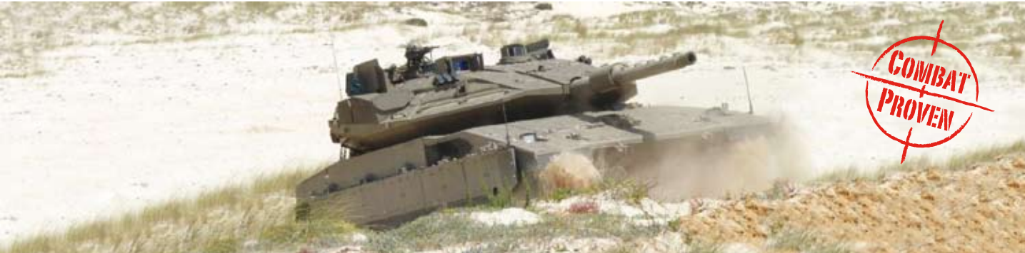
Trophy - HV

Trophy Family™ Active Protection Hard Kill Systems for Heavy, Medium, and Light Armored Vehicles With Trophy, you are no longer an easy target