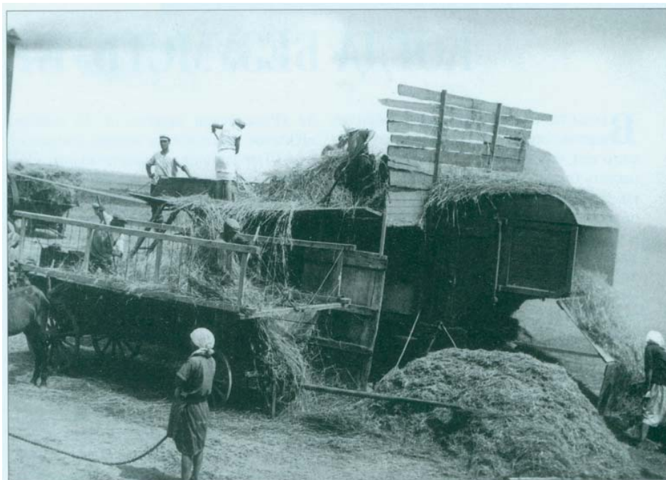
Молотьба на колхозном поле. Днепропетровская область. 1933 г. РГАСФД.