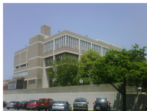
The Student Union building at Queens College.