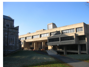
Rensselaer Polytechnic Institute's Folsom Library