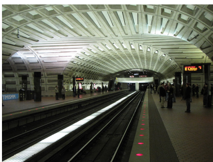
Many stations of the Washington Metro system display Brutalist characteristics