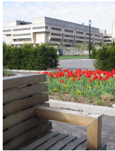
Posvar Hall at the University of Pittsburgh