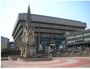
Birmingham Central Library Building, Birmingham, England.