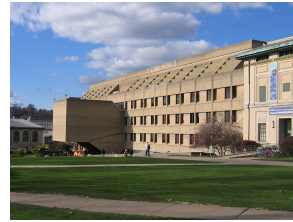
Wean Hall, Carnegie Mellon University, Pittsburgh.