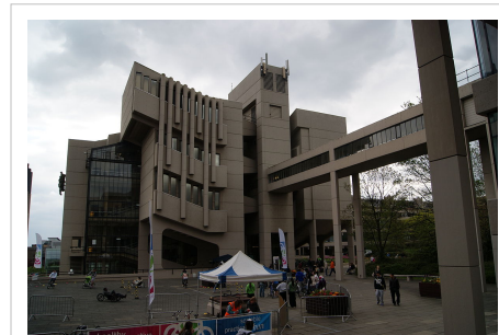
The Roger Stevens Building at the University of Leeds is the centre piece to a large complex of Brutalist buildings connected by skyways.