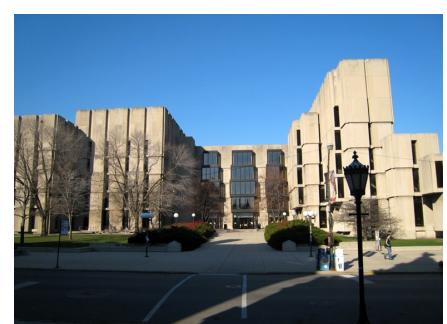
The Regenstein Library at the University of Chicago, designed in the late 1960s by Walter Netsch