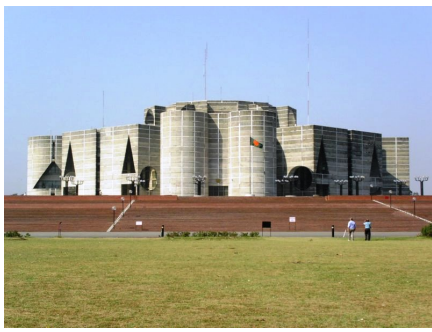
The Jatiyo Sangshad Bhaban (National Assembly Building of Bangladesh), 1961-1981, by Louis Kahn.