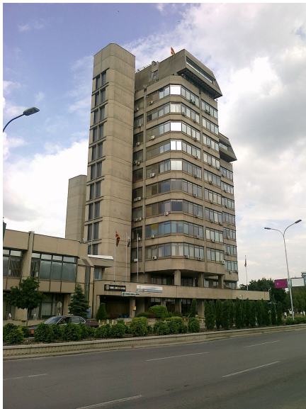
The building of the National bank of Macedonia.