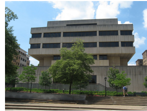
The Barco Law Building at the University of Pittsburgh School of Law