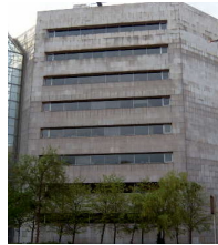
The Civic Offices, Wood Quay, Dublin