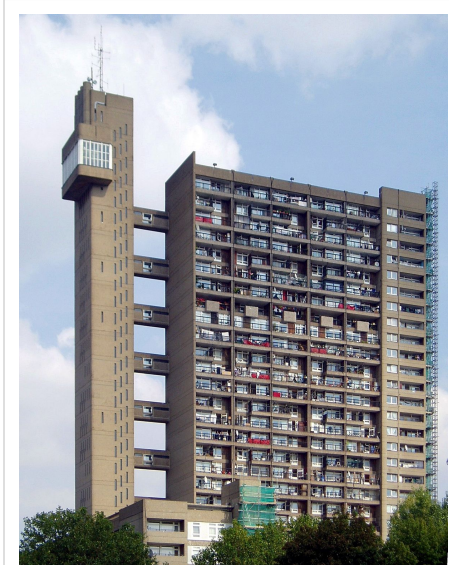
Trellick Tower, London, 1966-1972, designed by Ernő Goldfinger. It is Grade II* listed.

The architectural style known as Brutalism and the architectural and urban theory known as New Brutalism may be regarded as two different movements, although the terms are often used interchangeably. The New Brutalism of the British members of Team 10, Alison and Peter Smithson, is more related to the theoretical reform of the CIAM (in architecture and urbanism) than to "béton brut". Reyner Banham formulated this difference in the title of his book: "The New Brutalism - Ethic or Aesthetic?"