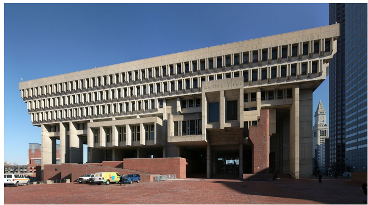
Boston City Hall, part of Government Center, Boston, Massachusetts (Gerhardt Kallmann and N. Michael McKinnell, 1969). The structure illustrates typical (but not necessary) Brutalist characteristics such as top-heavy massing, the use of slender base supports, and the sculptural use of raw concrete.

Brutalist architecture is a style of architecture which flourished from the 1950s to the mid 1970s, spawned from the modernist architectural movement.