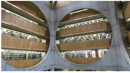
The Interior of the Phillips Exeter Academy Library, 1965-1971, by Louis Kahn.