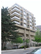
University of Pittsburgh School of Information Sciences building.