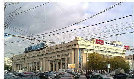
The building of RIA Novosti, former press-center of 1980 Summer Olympics (Moscow, USSR), 1979