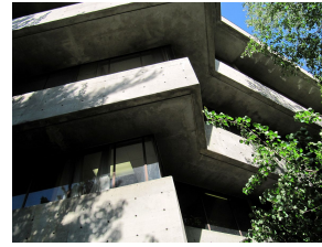
The John Andrews Building of the University of Toronto Scarborough