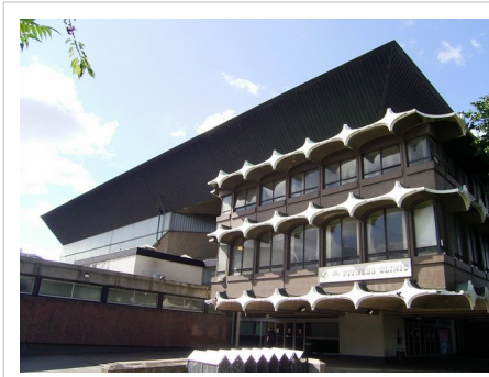
The Leeds International Pool, built in 1967, designed by disgraced British architect John Poulson. Demolished 2009.

Although the Brutalist movement was largely dead by the mid-1980s, having largely given way to Structural Expressionism and Deconstructivism, it has experienced an updating of sorts in recent years. Many of the rougher aspects of the style have been softened in newer buildings, with concrete façades often being sandblasted to create a stone-like surface, covered in stucco, or composed of patterned, pre-cast elements. Modernist architects taking this approach in recent projects include Steven Ehrlich, Ricardo Legorreta, and Gin Wong. The firm of Victor Gruen and Associates has revamped the style for the many courthouse buildings it has been contracted to design. Architects from Latin America have been reviving the style on a smaller scale in recent years. Brutalism has recently experienced a