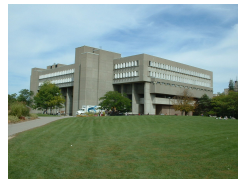
The Mathematics and Computer Building at the University of Waterloo in Waterloo, Ontario