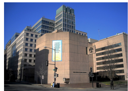
The proposed demolition of the Third Church of Christ, Scientist in Washington, D.C. has resulted in court battles between historic preservationists and church members.

Matthew Yglesias, a commentator at Think Progress, has argued that brutalist structures in Boston such as its City Hall "sort of kill pleasant urbanist neighborhoods". [8]