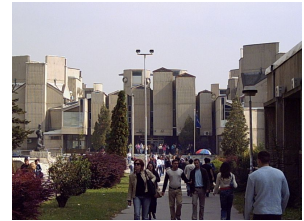
Ss. Cyril and Methodius University of Skopje