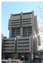
The Malcom Moos Health Sciences Tower at the University of Minnesota Twin Cities campus.