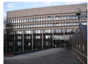
The Coventry School of Art and Design's Graham Sutherland Building.