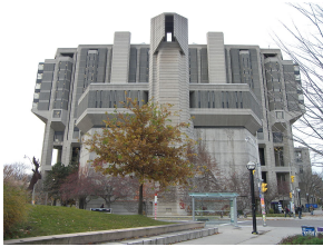
University of Toronto's Robarts Library in downtown Toronto, Ontario, Canada.