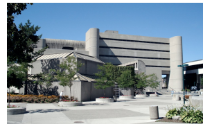
D.B. Weldon Library at the University of Western Ontario