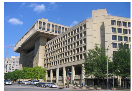
J. Edgar Hoover Building in Washington, D.C.

Another common theme in Brutalist designs is the exposure of the building's functions—ranging from their structure and services to their human use—in the exterior of the building. In the Boston City Hall ( illustration right ), designed in 1962, the strikingly different and projected portions of the building indicate the special nature of the