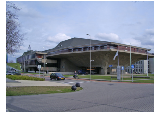
The Aula of Delft University in the Netherlands.