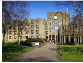
Darwin College at the University of Kent