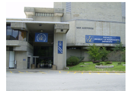
University of Massachusetts Dartmouth Campus Center, as designed by Paul Rudolph