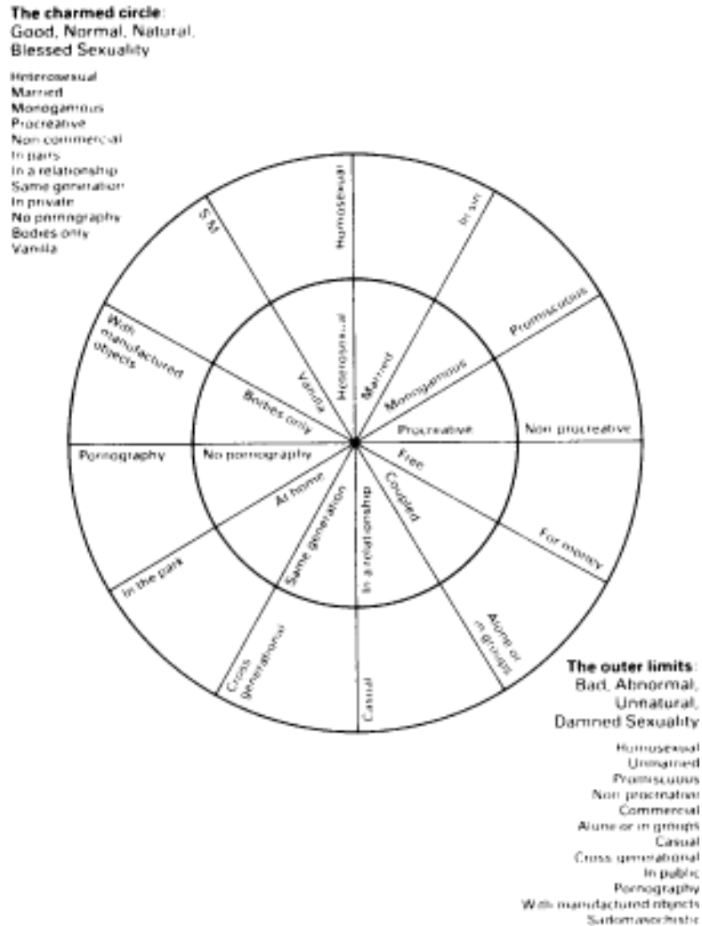
Figure 9.1: The sex hierarchy: the charmed circle vs. the outer limits

and cross-generational encounters are still viewed as unmodulated horrors incapable of involving affection, love, free choice, kindness, or transcendence.