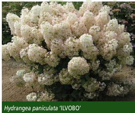
Hydrangea paniculata 'ILVOBO'