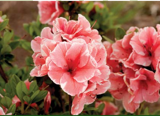
Azalea x 'Roblet'