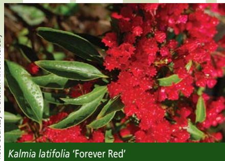
Kalmia latifolia 'Forever Red'