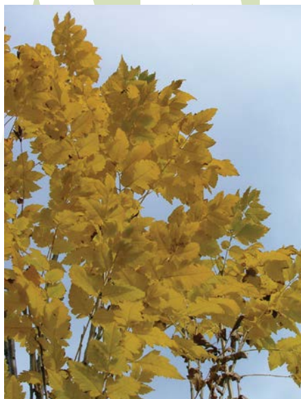
Koelreuteria paniculata 'Golcanzanzam' Golden Candle™