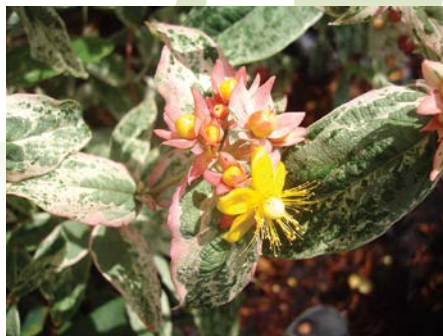
Hypericum androsaemum 'Snospzam' Snow Splash™