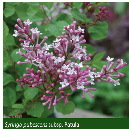
Syringa pubescens subsp. Patula