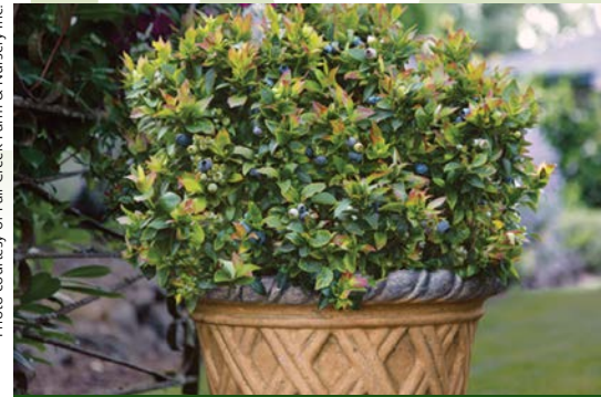
Vaccinium corymbosum 'Jelly Bean'

Common name: 'Raspberry Shortcake' raspberry Trademark: USPP22,141 Introduced by: Fall Creek Farm & Nursery Inc., Lowell, Ore. Hardiness: Zones 5 to 9 Ornamental features: Thornless, dwarf raspberry ideal suited to patio pots; needs no trellis or pollinator Habit and growth rate: Dense mound; 24 inches to 36 inches Culture: Full sun, neutral soil, good drainage, moderate water Pest/disease problems or unique resistance: No known issues Royalties: $0.50 royalty and $0.50 marketing fee Availability: 2-, 3-gallon containers through grower network For more information: Amy Daniel; amyd@fallcreeknursery.com