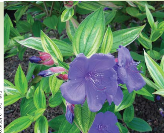
Tibouchina urvilleana 'TB01'

For more information: smccoy@digplant.co.com