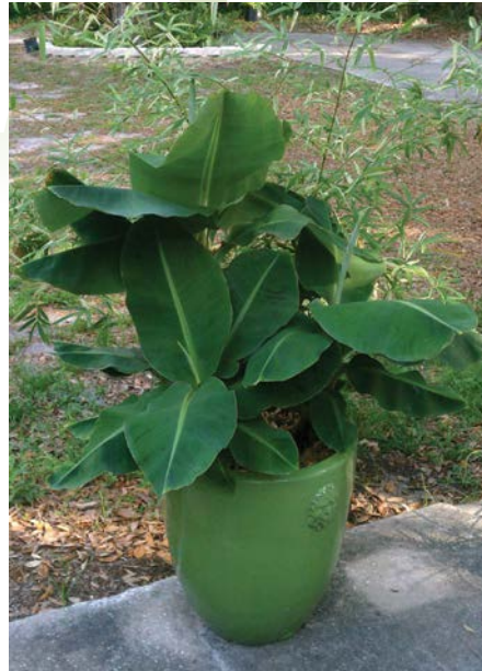
Musa 'Poquito' PPAF