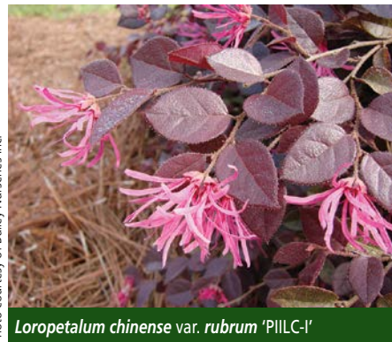
Loropetalum chinense var. rubrum 'PIILC-I'

For more information: khennessy@axiom.com