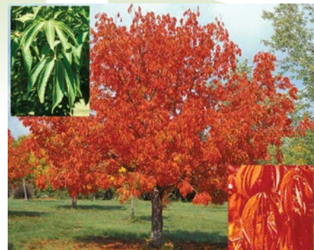
Aesculus x 'Bergeson'