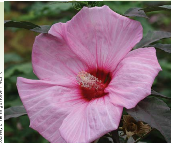
Electric Wizard hibiscus

For more information: gretchen@flemingsflowers.com