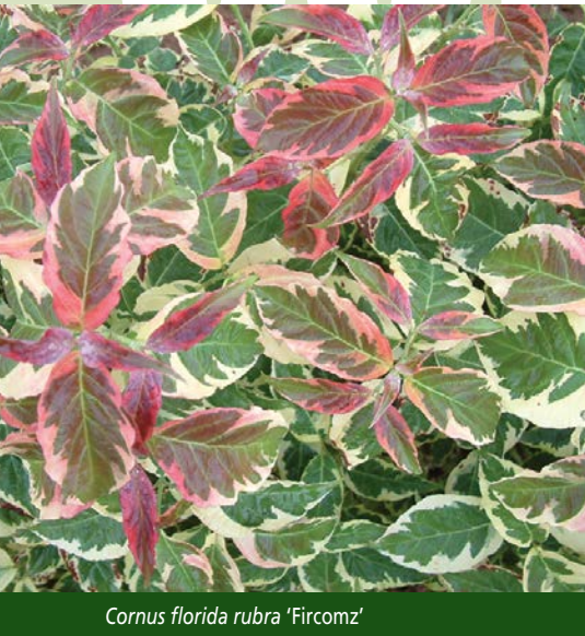
Cornus florida rubra 'Fircomz'