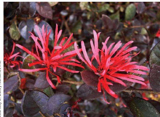
Loropetalum chinense var. rubrum 'PIILC-II'

For more information: khennessy@axiom.com