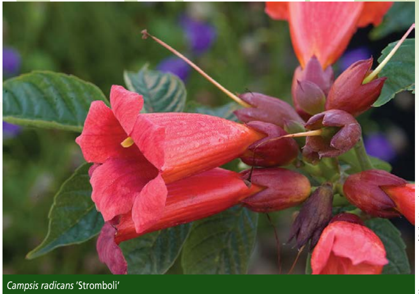
Campsis radicans 'Stromboli'

For more information: khennessy@axiom.com