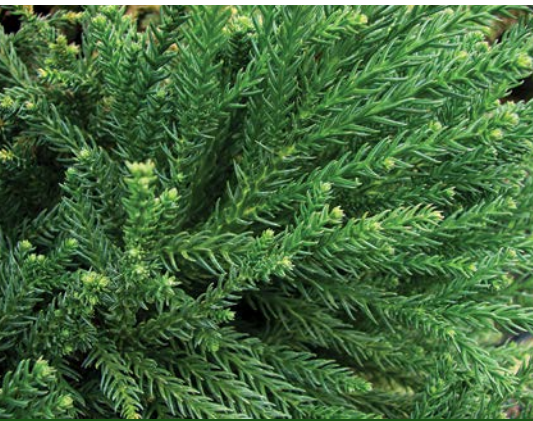
Cryptomeria japonica 'PIICJ-I'