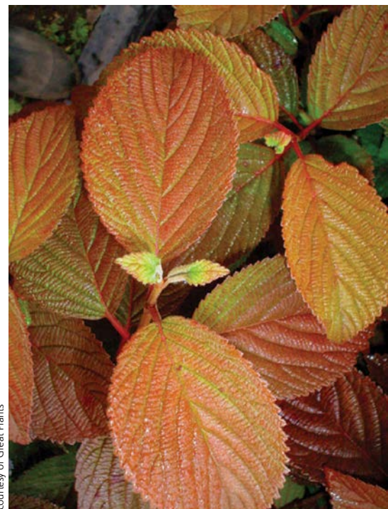
Viburnum plicatum f. tomentosum 'Copper Ridges'