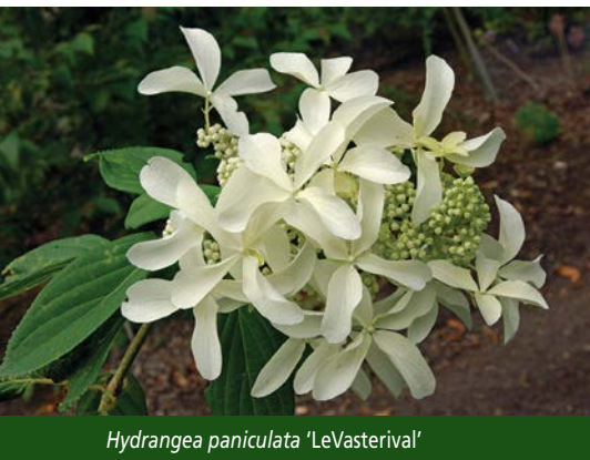
Hydrangea paniculata 'LeVasterival'

For more information: khennessy@axiom.com