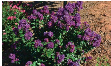
Lagerstroemia 'Purple Magic'

For more information: khennessy@axiom.com