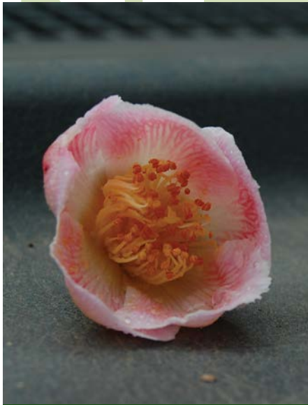
Stewartia rostrata 'Pink Satin'