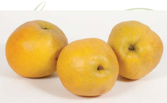
Pyrus 'Tawara Oriental'

For more information: khennessy@axiom.com