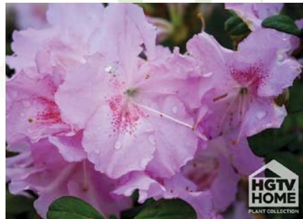
Azalea AFCH 02-74