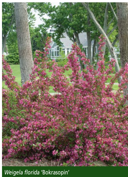
Weigela florida 'Bokrasopin'