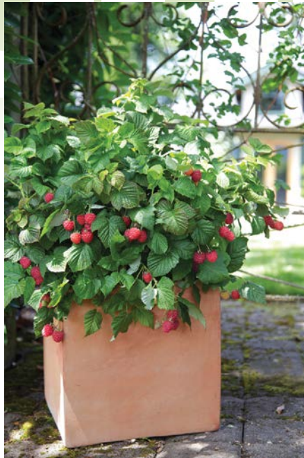
Rubus idaeus 'Raspberry Shortcake'

Common name: Coastal rosemary Trademark: Grey Box™; PPAF Introduced by: DIG Plant Co., Mt. Pleasant, S.C. Hardiness: Semi-deciduous in Zone 8; evergreen in zone 9 Ornamental features: Grey Box has a very compact, box-shaped habit and gray foliage with loads of small white flowers in spring and early fall Habit and growth rate: Grey Box will grow to approximately 2 feet tall and wide (depending on environment and level of inputs) and matures at a relatively slow rate Culture: Best suited for full sun applications and free draining, acidic soils; drought-, frost- and salt-tolerant Pest/disease problems or unique resistance: Seems to handle tropical conditions better than many other Westringia Royalties: Paid at the time of liner purchase; tag included and no license required Availability: Liners; c/p 72 For more information: smccoy@digplant.com