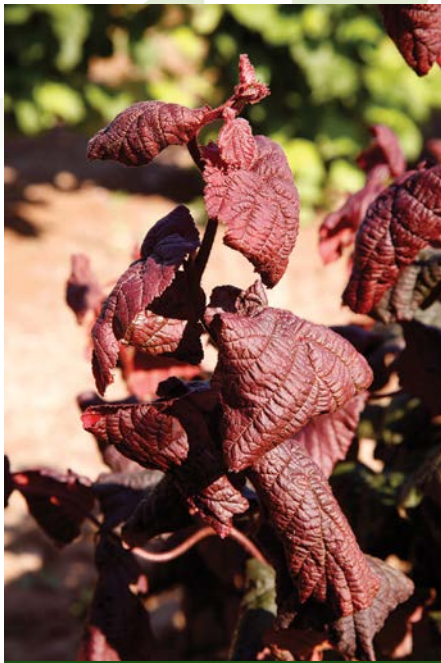
Corylus avellana Red Dragon