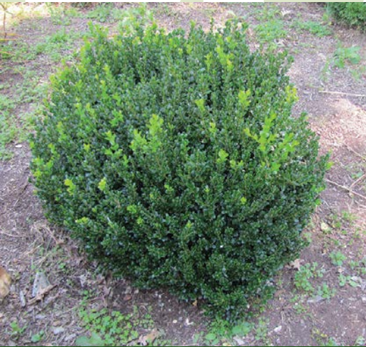
Buxus 'Little Missy'