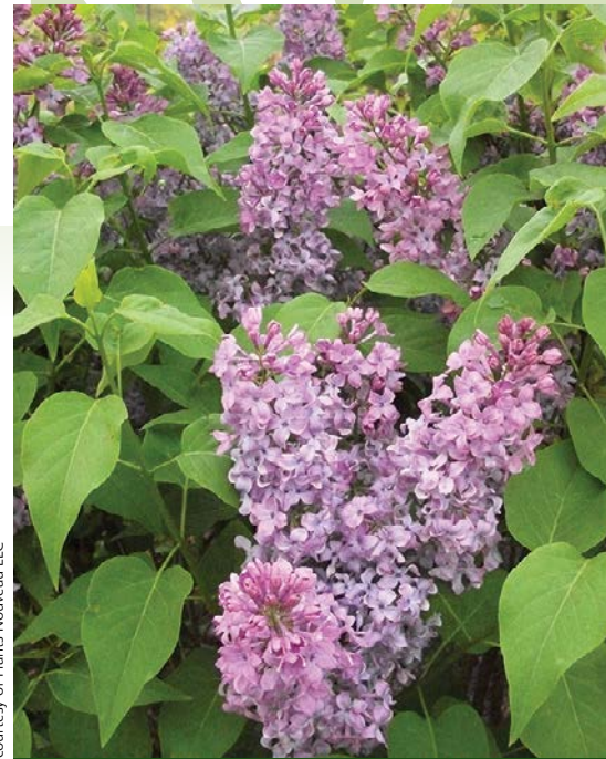
Syringa vulgaris 'Eldancer'