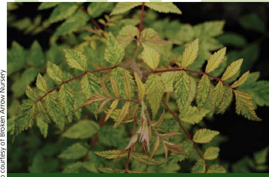
Rubus cockburniana 'Razzle Dazzle'