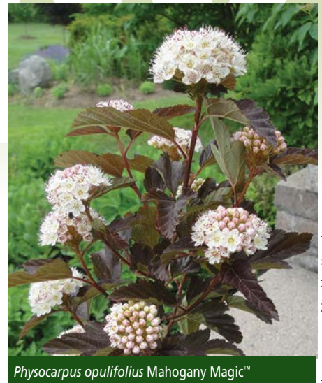
Physocarpus opulifolius Mahogany Magic™

For more information: sales@sheridannurseries.com