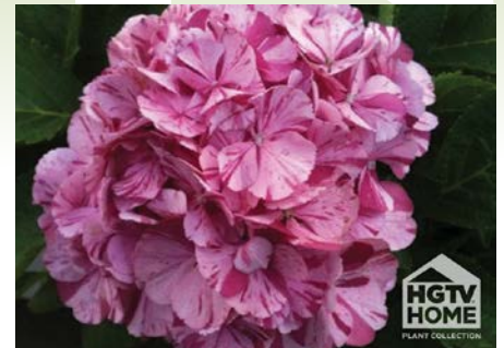
Hydrangea macrophylla 'Sweet Fantasy'