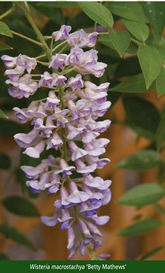
Wisteria macrostachya 'Betty Mathews'