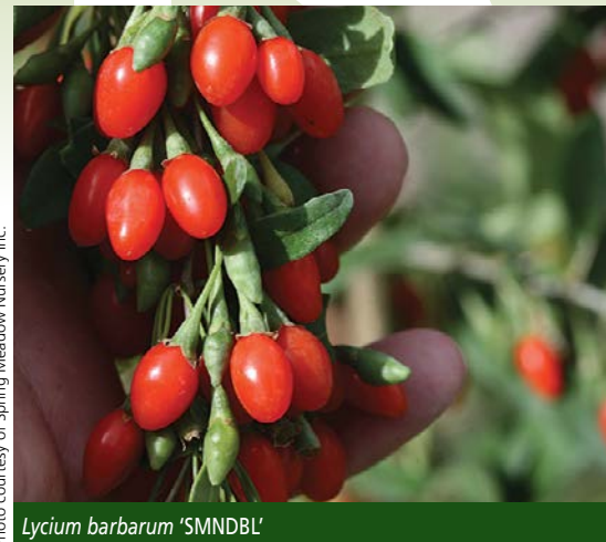
Lycium barbarum 'SMNDBL'

For more information: Shannon Springer; shannon@springmeadownursery.com