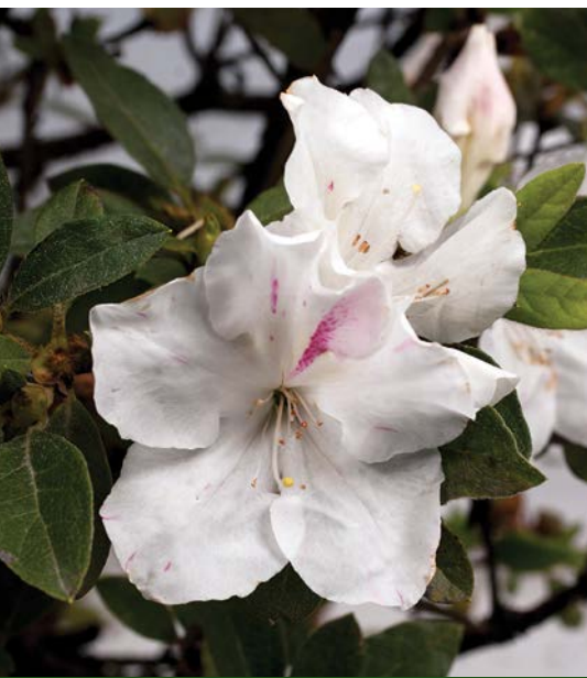
Azalea x 'Roblex'

For more information: Plant Development Services Inc./EncoreAzaleas; info@plantdevelopment.com