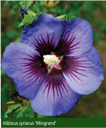
Hibiscus syriacus 'Mingrand'