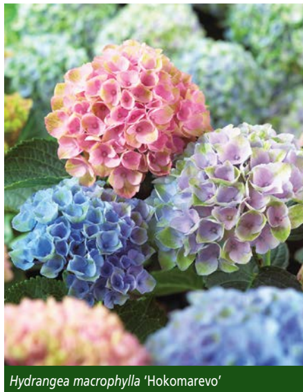
Hydrangea macrophylla 'Hokomarevo'

Common name: Everlasting™ Revolution hydrangea Trademark: PP#22260 Introduced by: Plants Nouveau LLC, Charleston, S.C. Hardiness: Zones 5 to 9 Ornamental features: Long lasting, strong flowers of the Everlasting series feature a variety of colors and handsome foliage; as the flowers age, they change from one exciting color to the next; each flower lasts for months. Revolution flowers on new and old wood, and flowers fade to magical color combinations of deep pink, maroon and true blue, adding green highlights as they age over a long period of time Habit and growth rate: 2 feet tall by 3 feet wide Culture: Full sun to part shade, prefers afternoon shade; average to moist garden soil Pest/disease problems or unique resistance: None known Royalties: Yes; depends on size Availability: Liners, 3-, 5- and 7-gallon containers For more information: Angela Treadwell-Palmer; angela@plantsnouveau.com