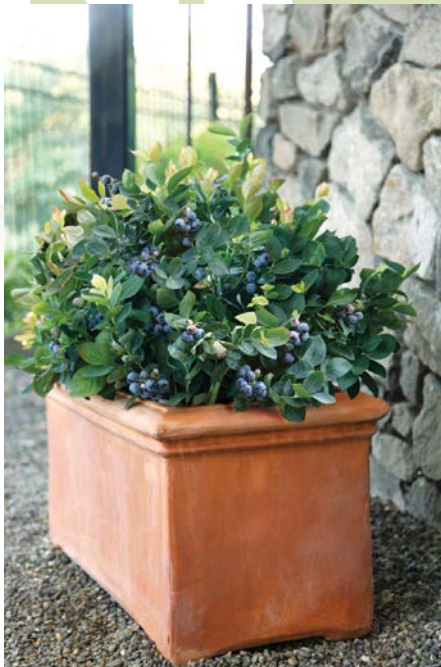
Vaccinium corymbosum 'Peach Sorbet'