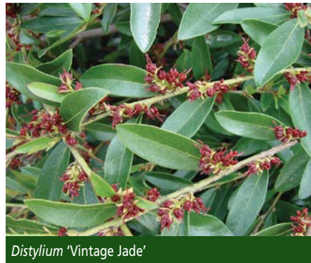
Distylium 'Vintage Jade'

For more information: khennessy@axiom.com