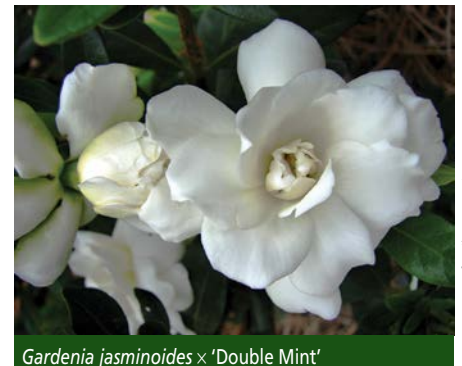
Gardenia jasminoides x 'Double Mint'

For more information: khennessy@axiom.com