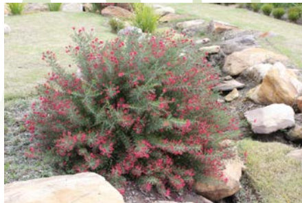
Grevillea rosmarinifolia 'GH16'