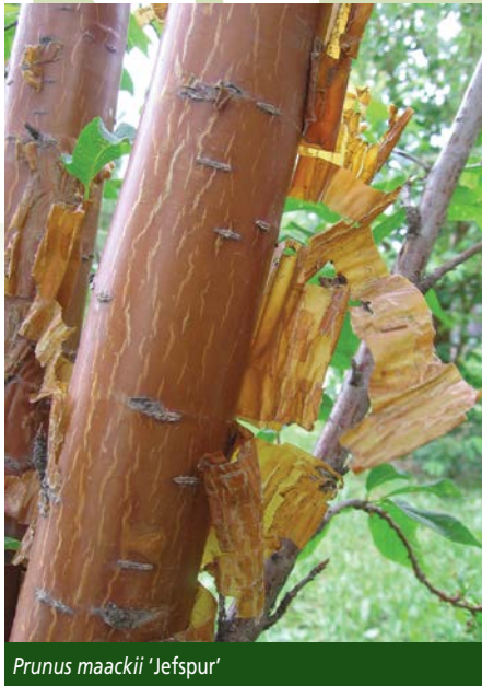
Prunus maackii 'Jefspur'