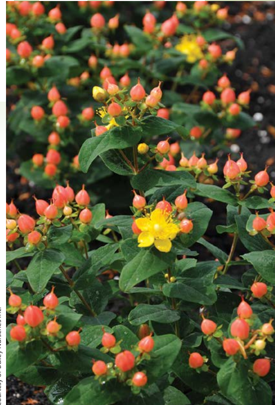
Hypericum inodorum 'Kolmapuki'

For more information: khennessy@axiom.com