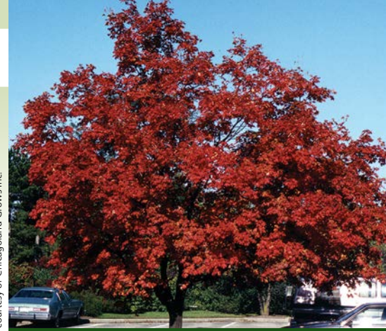
Acer saccharum 'Morton'

For more information: jault@chicagobotanic.org