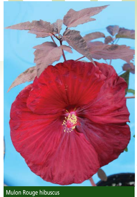
Mulan Rouge hibiscus

For more information: gretchen@flemingsflowers.com