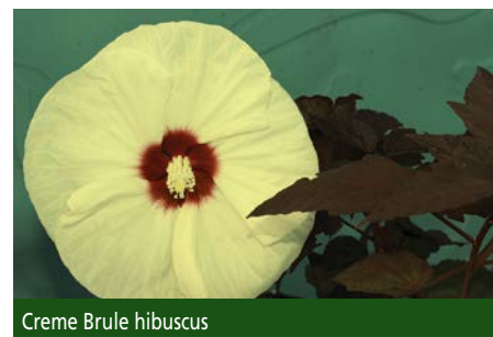
Crème Brule hibiscus

For more information: gretchen@flemings-flowers.com