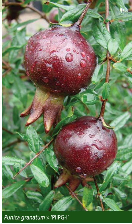
Punica granatum x 'PIIPG-I'

For more information: khennessy@axiom.com