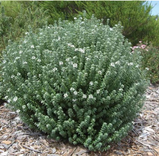
Westringia fruticosa 'WES04'