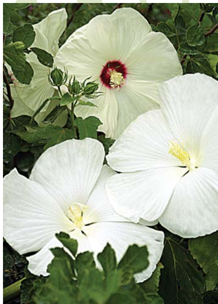
Crystal Ball hibiscus