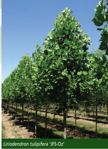
Liriodendron tulipifera 'JFS-Oz'