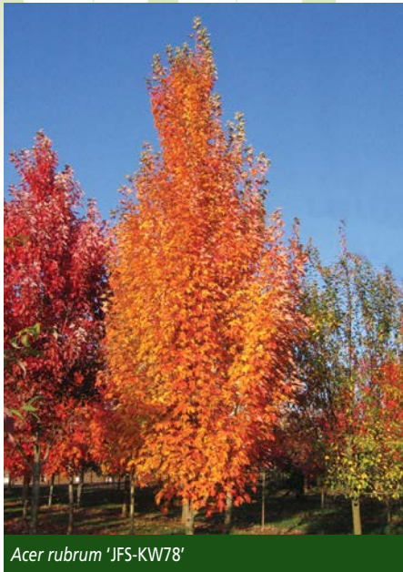
Acer rubrum 'JFS-KW78'