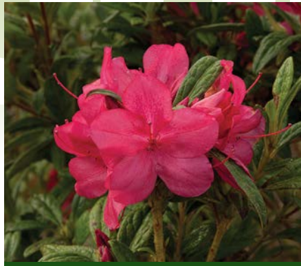
Azalea x 'Robleu'

For more information: Plant Development Services Inc./EncoreAzaleas; info@plantdevelopment.com