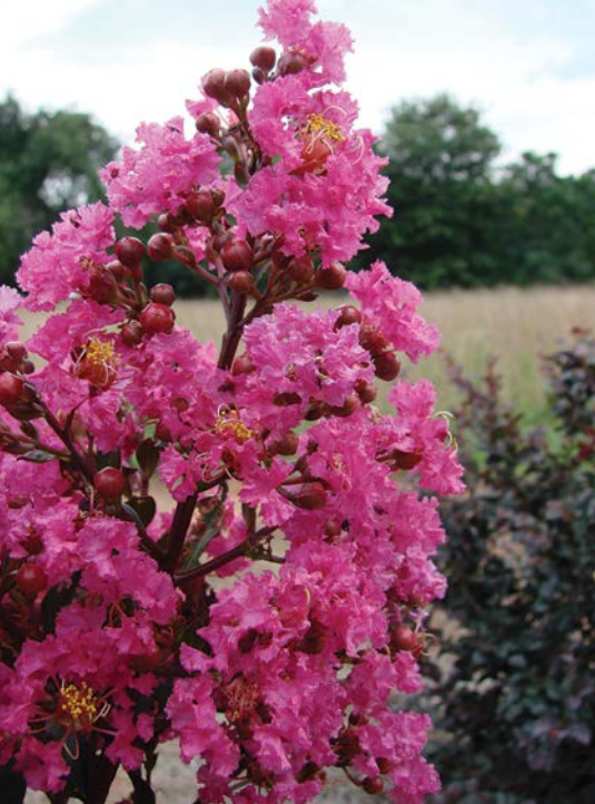
Lagerstroemia 'Plum Magic'