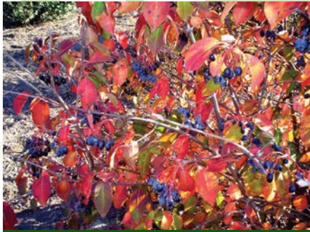
Viburnum x 'Prairie Classic'