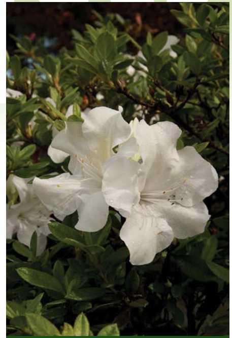
Azalea x 'Robley'

For more information: Plant Development Services Inc./EncoreAzaleas; info@plantdevelopment.com