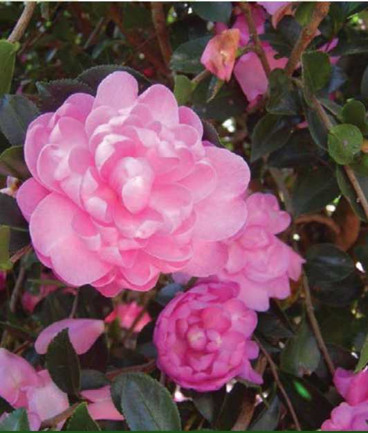
Camellia hiemalis 'Susy Dirr'