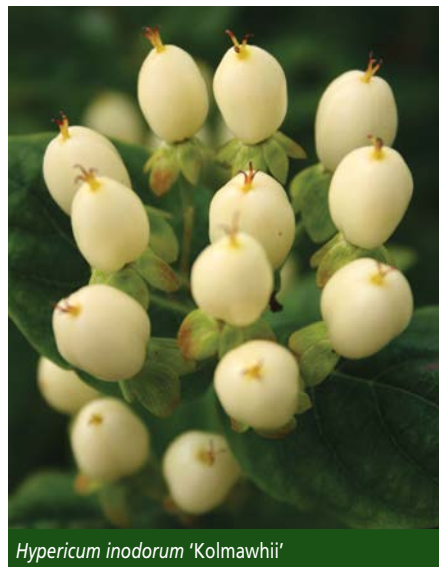
Hypericum inodorum 'Kolmawhii'

For more information: khennessy@axiom.com