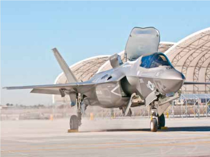
US Marine Corps