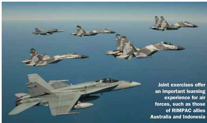
Joint exercises offer an important learning experience for air forces, such as those of RIMPAC allies Australia and Indonesia