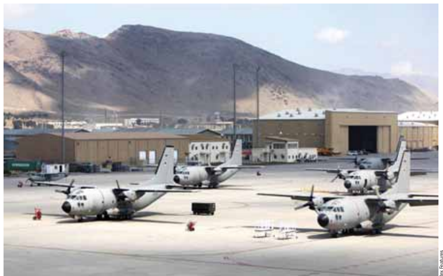
Afghanistan's growing air force inventory includes C-27A and Cessna 208 transports