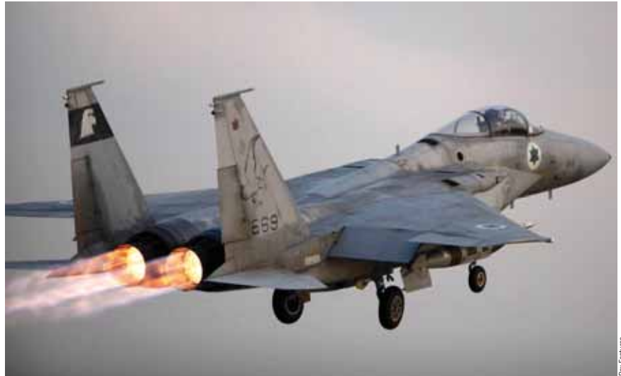
Israel's air campaign against Hamas militants involved combat types such as the F-15