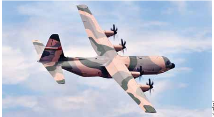
The Royal Air Force of Oman has accepted its first C-130J tactical transport