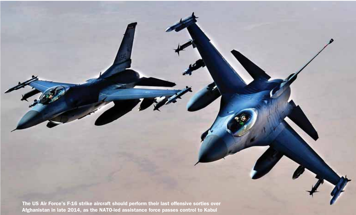
The US Air Force's F-16 strike aircraft should perform their last offensive sorties over Afghanistan in late 2014, as the NATO-led assistance force passes control to Kabul