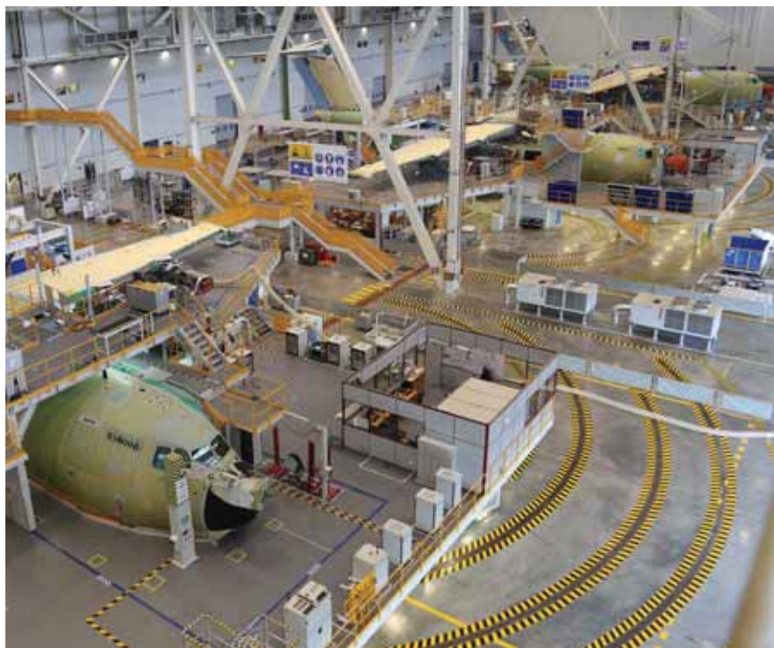
The French air force is scheduled to receive its first three A400Ms during 2013