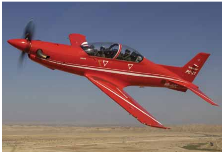
Pilatus has secured fresh orders for the PC-21 trainer from Qatar and Saudi Arabia