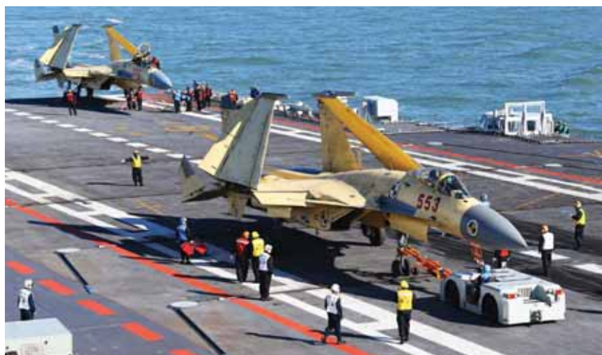
Shenyang L-15s have performed at-sea trials aboard China's aircraft carrier Liaoning