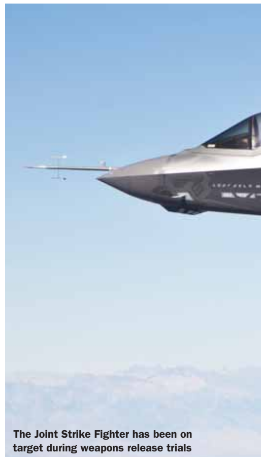
The Joint Strike Fighter has been on target during weapons release trials

India's planned medium multirole combat aircraft acquisition reached the preferred bid