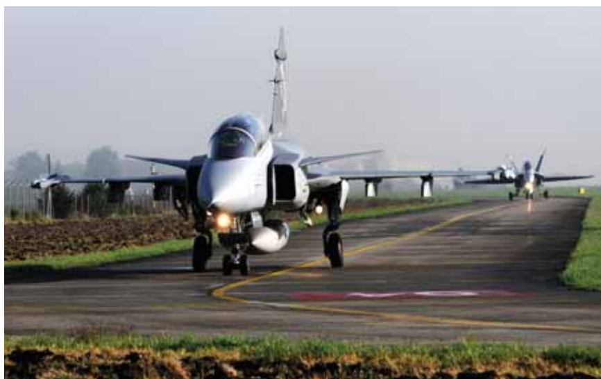
Sweden and Switzerland could buy up to a combined 82 new-generation Gripen fighters