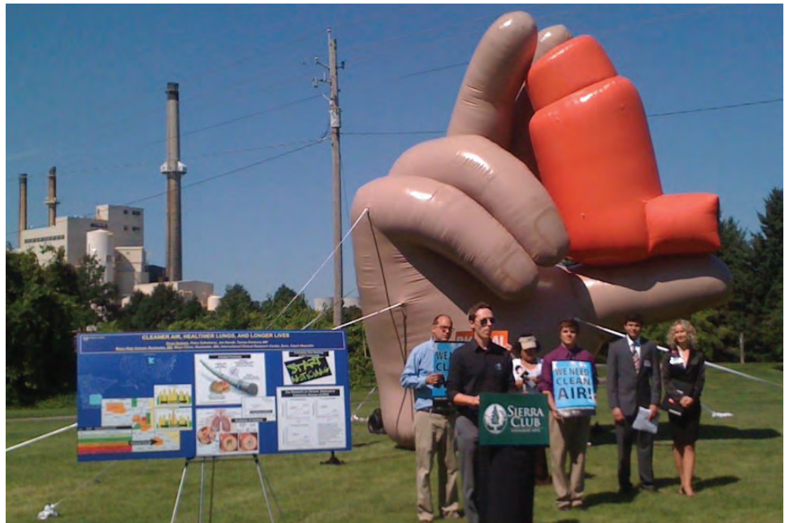
At a Sierra Club press conference last summer, Rochester residents and experts spoke in front of a giant inhaler, and the Silver Lake coal plant, about health risks from coal.