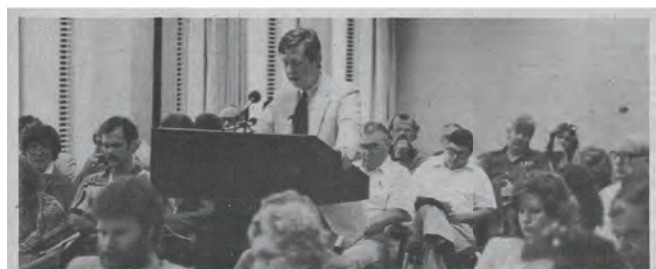
WRITTEN WOLF COMMENTARY TO BE IN BY SEPTEMBER 13

Unfortunately the wolf was not the only casualty of this legislature.