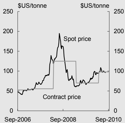
Chart B: Thermal coal spot and contract price

Thermal coal and metallurgical coal contract price forecasts are consistent with current spot prices (Chart B).