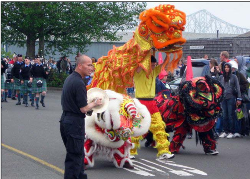
Chinese Lion Dancers lead the parade along the Astoria Riverwalk from the Heritage Fair to the 17th Street Plaza for the Mayor's welcome ceremony.