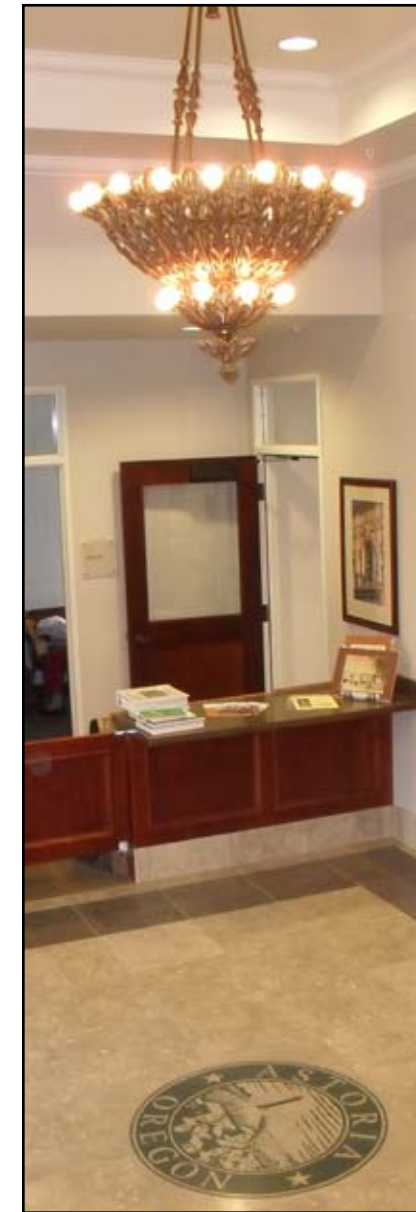
Opposite: The chandelier in the new lobby of Astoria City Hall.

It was disassembled, polished, reassembled and rewired to code. The light now hangs centered above the city's logo in the front lobby.