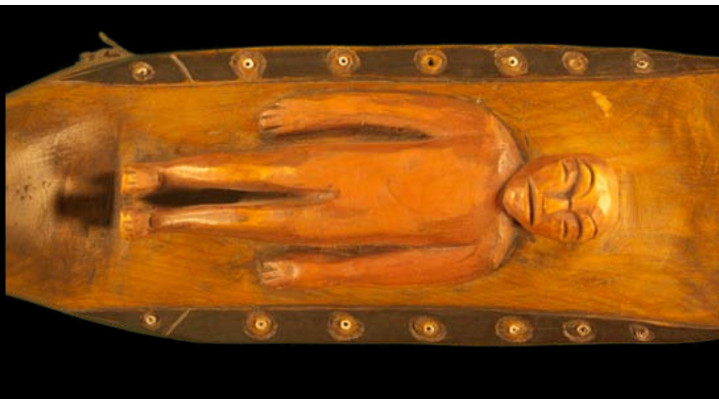
Detail view of Tlingit ceremonial dance mummy. Acc# 10.107.215