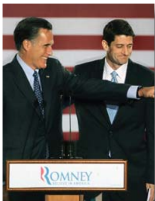
Mitt Romney/Paul Ryan