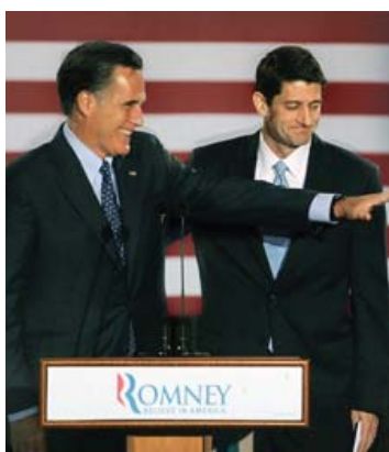
Mitt Romney/Paul Ryan