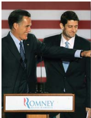
Mitt Romney/Paul Ryan