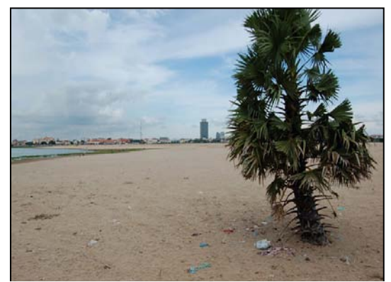
The southern end of Boeung Kak Lake, filled with sand, in July 2010.<sup>3</sup>

How LMAP had shifted from enjoying widespread support to impasse was the familiar story of problematic attempts by multilateral agencies and governments to relieve poverty and create economic growth via institutional reform. The reform project, intended to improve land administration in ten provinces, had inadvertently created new avenues for corruption and profiteering at the highest levels of Cambodia's government – a government lacking the internal controls or sufficient rule of law to ensure effective, fair implementation.