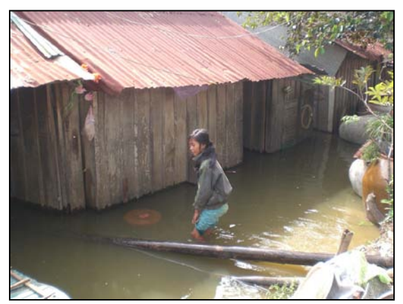
Houses were frequently flooded as the lake was filled with sand. NGOs claimed that flooding was a deliberate tactic used by Shukaku to force residents off their land. <sup>21</sup>

On August 28, 2009, the LMAP project management team requested that the Government and Bank suspend implementation to allow time to reach consensus on how to address safeguard concerns. Instead, the Government requested the cancellation of the Credit on September 7<sup>20</sup> and announced their intention to terminate LMAP altogether.