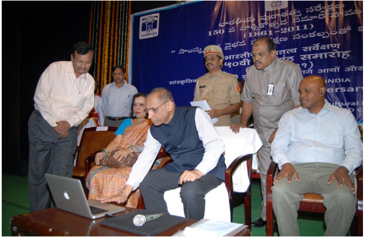
Chief Guest, His Excellency, the Governor of A.P., launching the web site of Hyderabad Circle