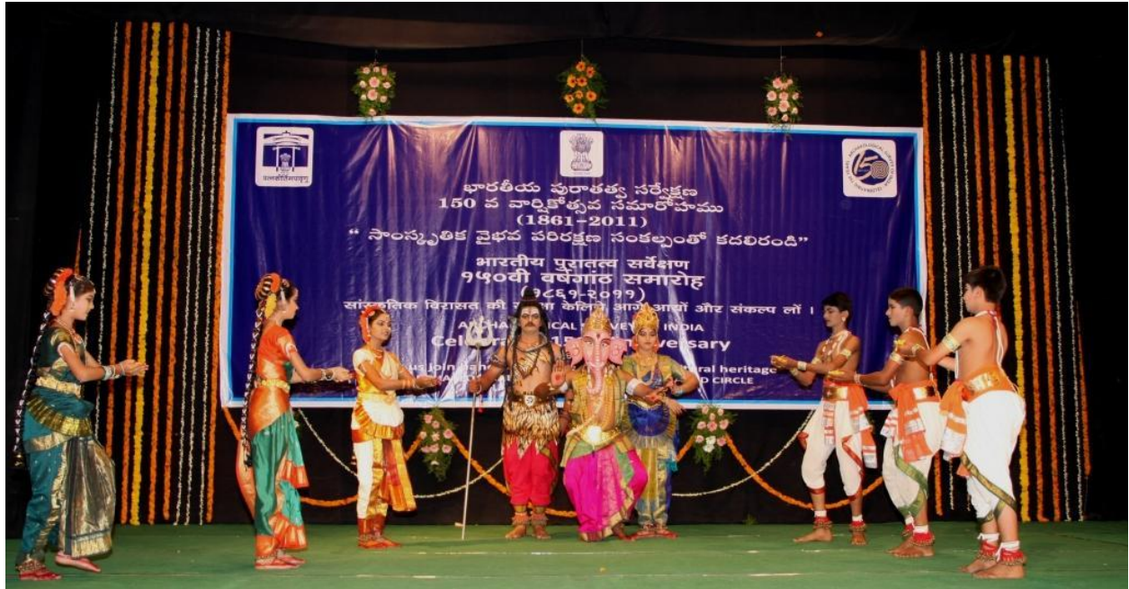
Artists performing Cultural programmes