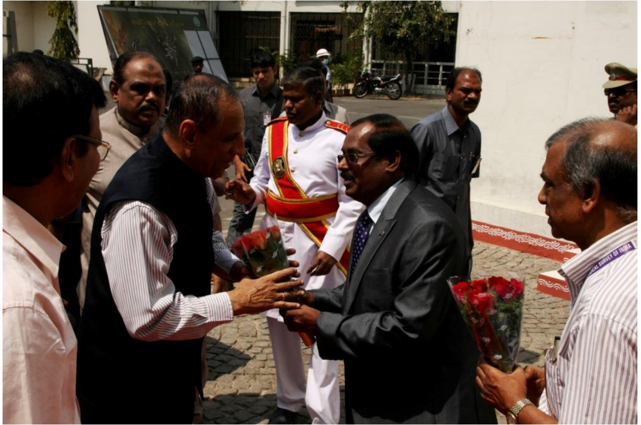
Chief Guest, Shri E.S.L. Narasimhan, His Excellency, the Governor of Andhra Pradesh warmly received by ASI Officers at Ravindra Bharati Auditorium, Hyderabad