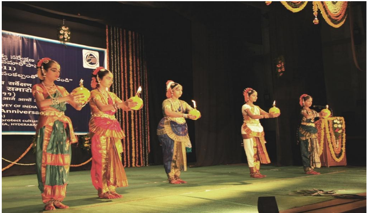
Artists performing Cultural programmes

The Superintending Archaeological Chemist, Hyderabad Division conveyed vote of thanks.