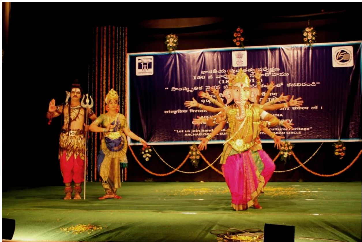
Artists performing Cultural programmes