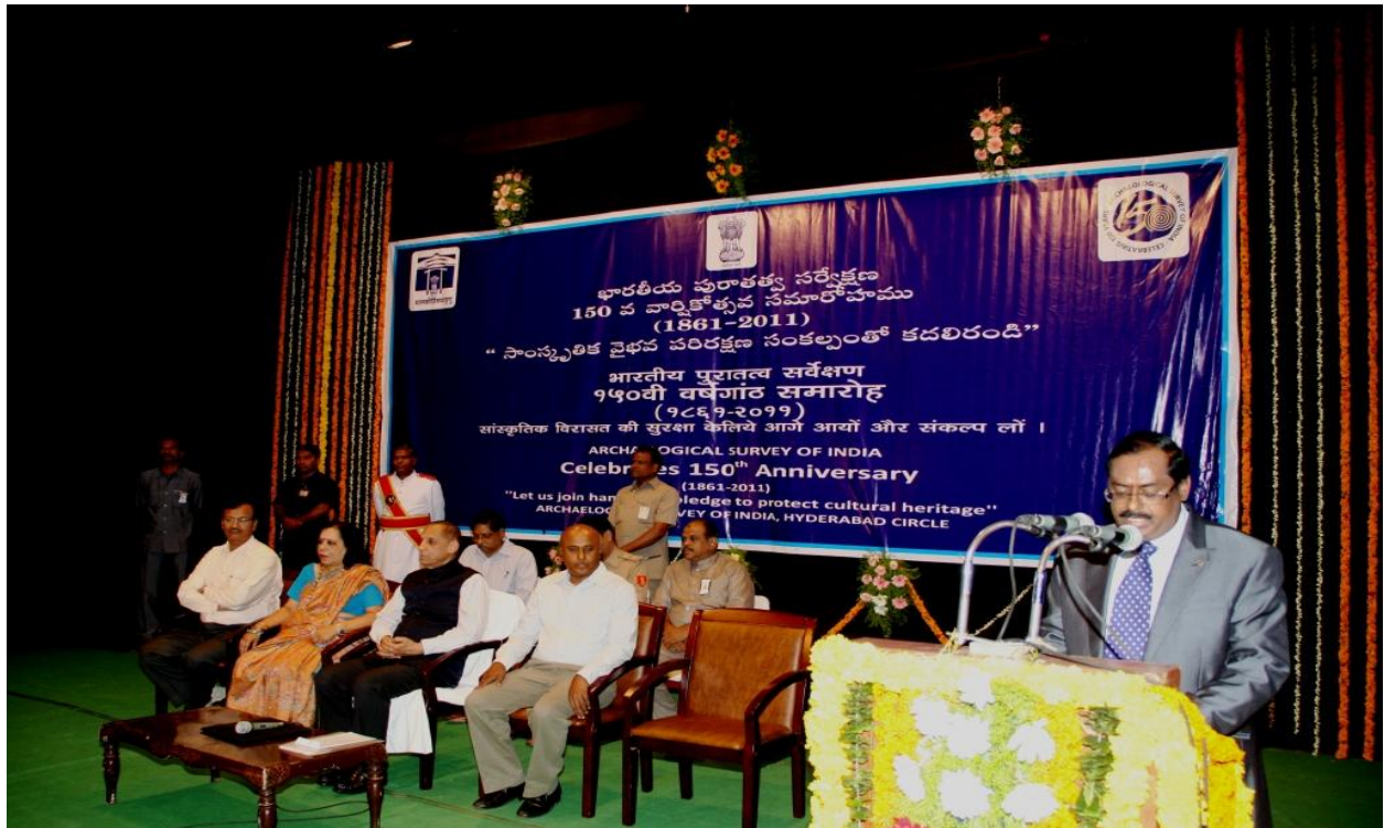
Superintending Archaeologist giving Welcome address