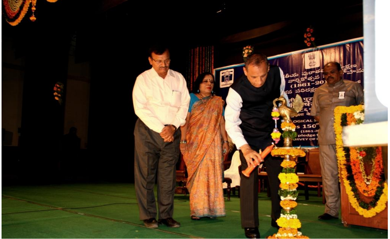
His Excellency watching photo Exhibition above and Lighting up the inaugural below.