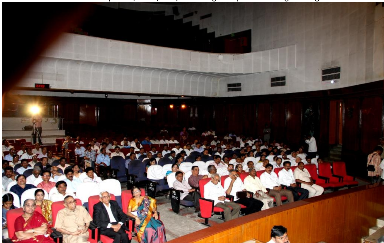
View of the audience