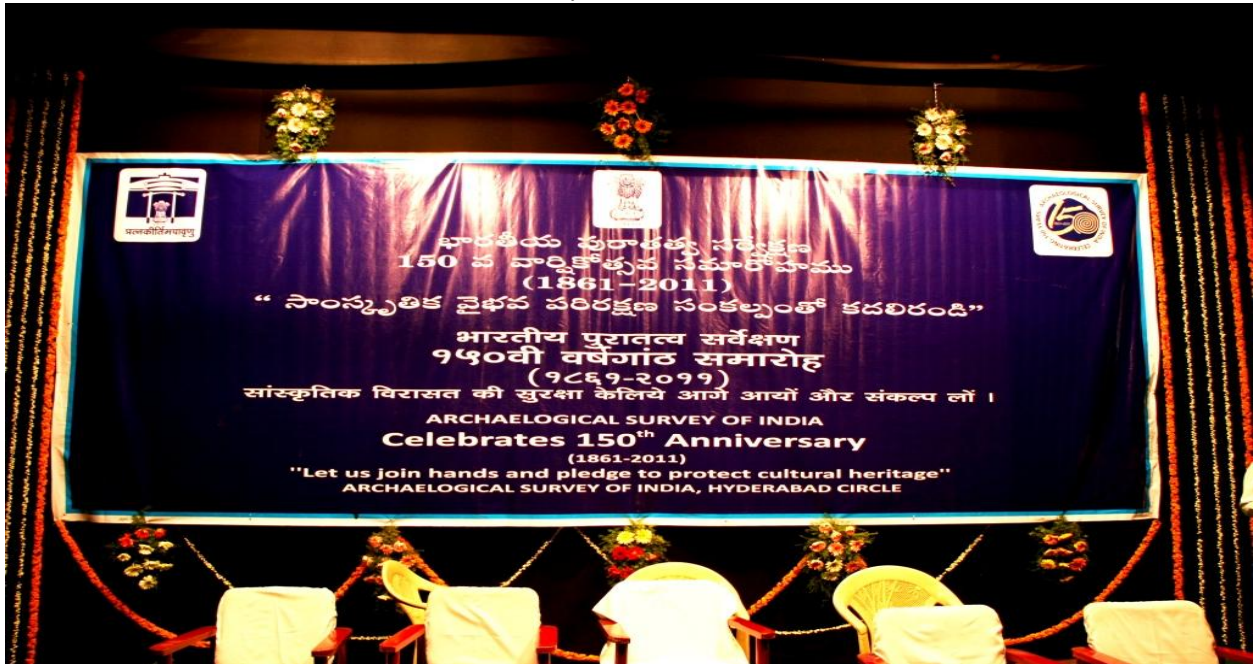
The Dias ready for the event.