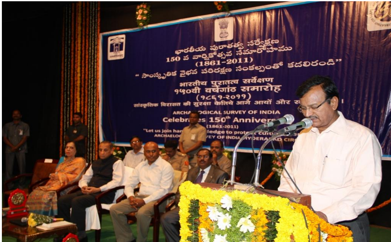
The Regional Director, ASI (South) delivering Presidential address.