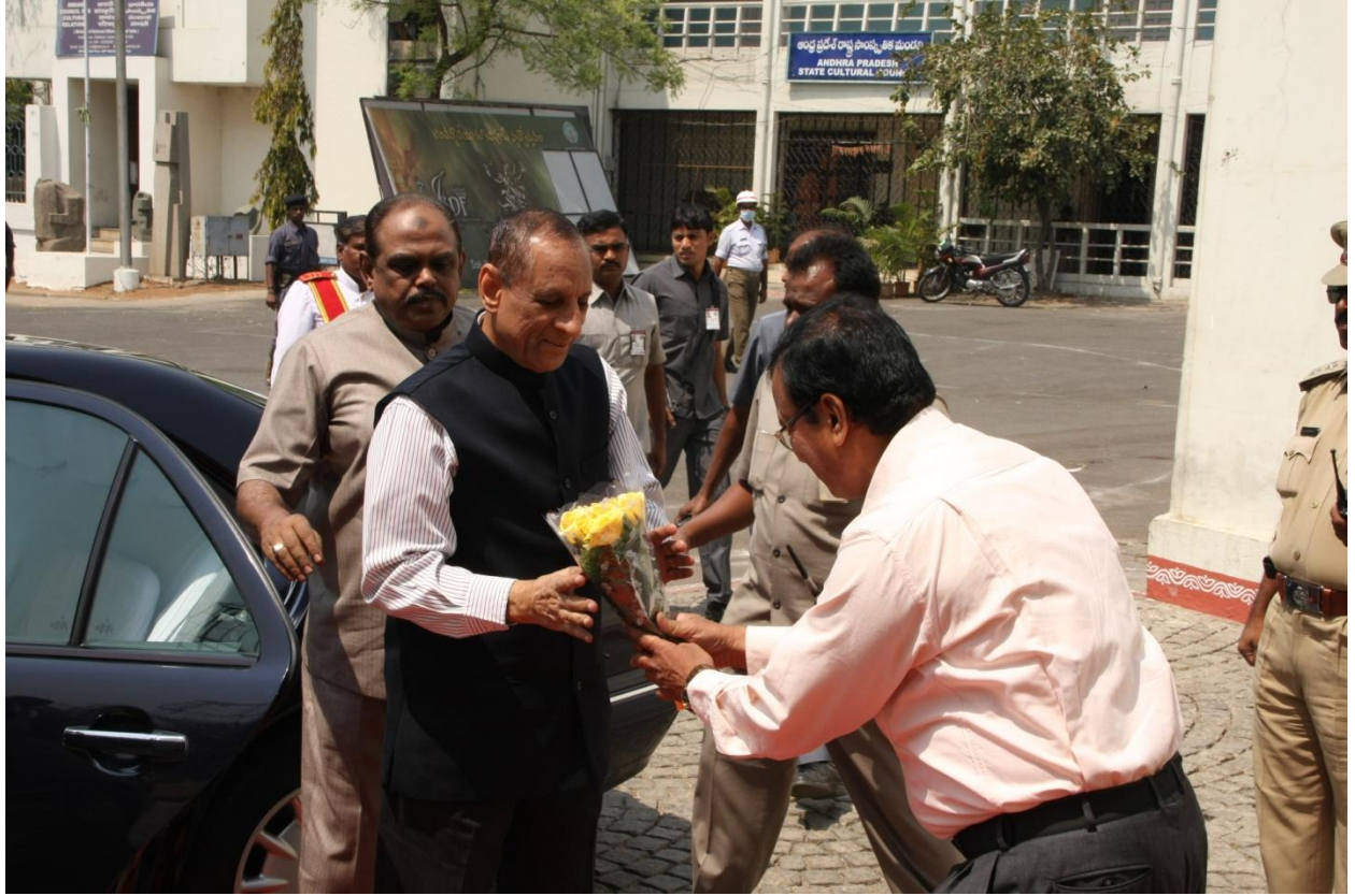
Chief Guest, Shri E.S.L. Narasimhan, His Excellency, the Governor of Andhra Pradesh warmly received by ASI Officers at Ravindra Bharati Auditorium, Hyderabad