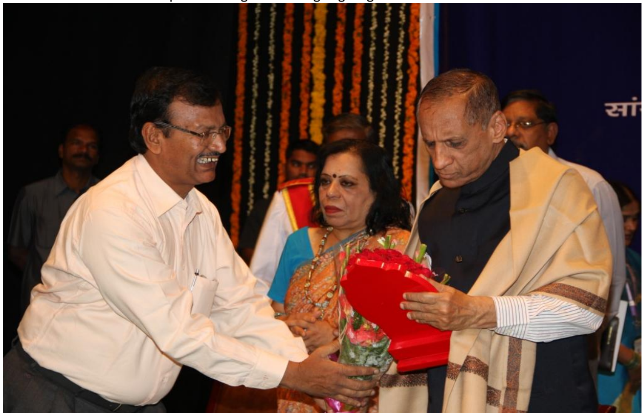
The Chief Guest, His Excellency felicitated by the Regional Director, ASI (South)