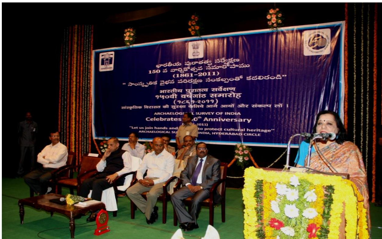
Guest of Honours The Principal Secretary, YAT & Culture, Govt. of A.P. addressing the gathering.