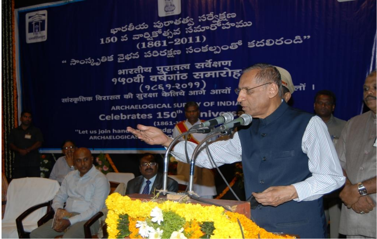
Chief Guest, His Excellency addressed the gathering

His Excellency going through the book after its release.