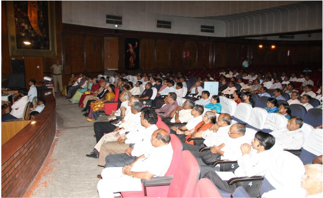
Another view of the audience.