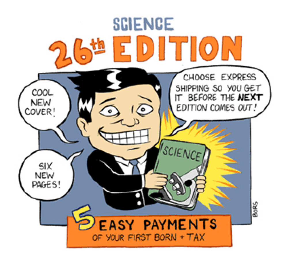
Illustration by Matt Bors