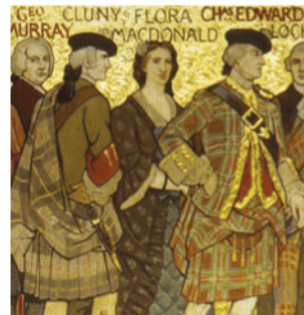
Flora MacDonald , Jacobite Heroine