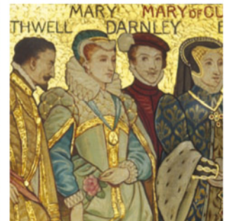
Mary , Queen of Scots