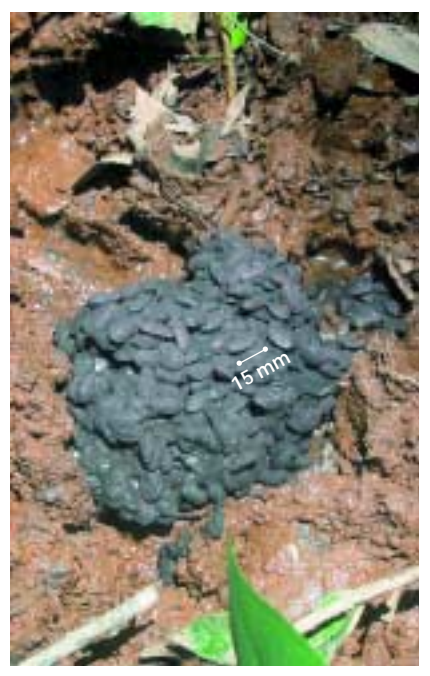
Seeds are spread over long distances in the droppings of feral pigs (shown here) and cassowaries.