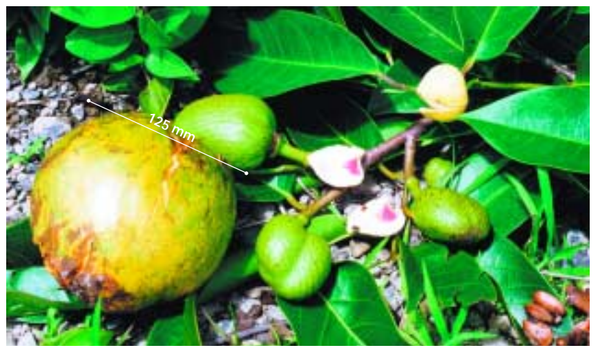
Pond apple fruit looks like a smooth-skinned custard apple.

The present limited distribution of pond apple and the relatively short life span of its seed are good reasons to try to eradicate all infestations. Isolated outbreaks should be treated immediately. Large infestations need to be controlled by a coordinated approach which includes the development of buffer zones.