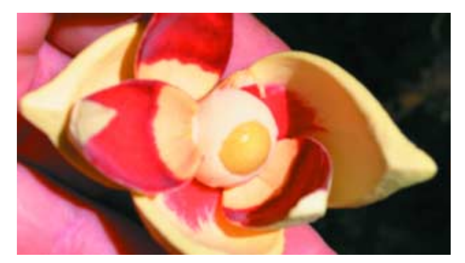
Flowers are only present for a short time during summer.

Pond apple is a native of North, Central and South America and West Africa. It