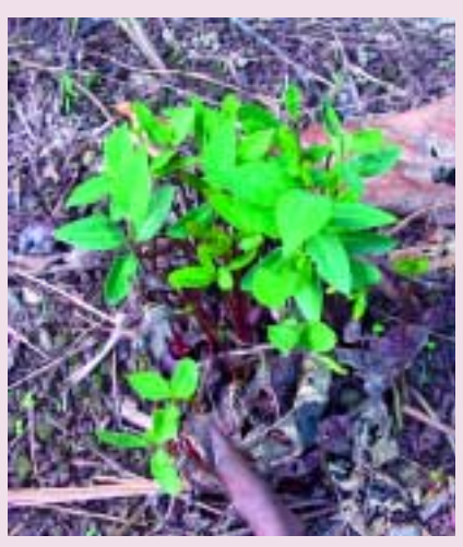
In moist, sunlit conditions thousands of seedlings can germinate, excluding other species.

An important part of the program has been raising public awareness about the weed. Once pond apple was controlled, the rainforest started to regenerate and many of the indigenous trees returned. In places where seed was buried by flood