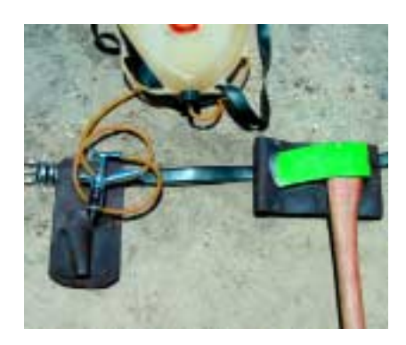
Stem injection can be conducted on foot using a 5 L backpack, injector gun and small axe.

When using herbicides always read the label and follow instructions carefully. Particular care should be taken when using herbicides near waterways because rainfall running off the land into waterways can carry herbicides with it. Permits from state or territory Environment Protection Authorities may be required if herbicides are to be sprayed on riverbanks.