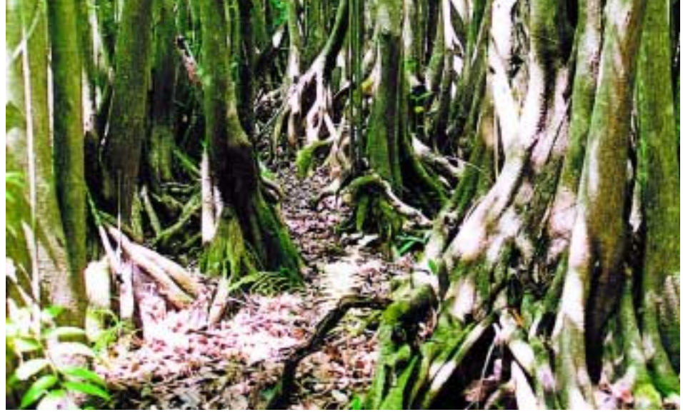
Pond apple seedlings mature quickly into tall dark forests.

Pond apple is a semi-deciduous woody tree, usually about 3–6 m tall, although it can grow up to 15 m. The plants have alternate leaves, 70–120 mm long with a prominent midrib. The leaves have a light- to dark-green upper surface