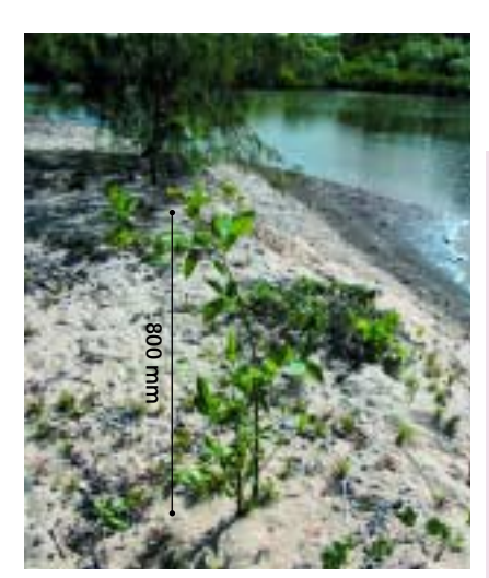
Pond apple grows in mangrove communities and can tolerate salt inundation.

The success and type of control measure used will depend on the situation. Pond apple usually grows in sensitive areas so methods should be chosen that do not have an adverse impact on non-target plants or on the surrounding environment.