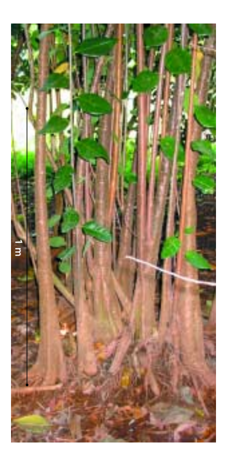
Several seedlings may germinate together, forming multiple-stemmed trunks.

debris or old dams were covered by undergrowth, pond apple seedlings are still emerging, so monitoring will need to continue for several years.