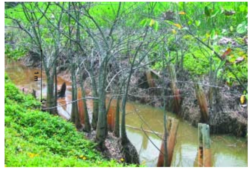
Treated pond apple in a drain near Liverpool Creek, south of Innisfail, Qld.

In still, dry conditions herbicide can also be applied by basal bark spraying and foliar (ie overall) spraying of seedlings. Both of these methods can be very effective, but care must be taken to prevent spray drift and minimise herbicide runoff and impacts on non-target organisms and environmentally sensitive areas such as wetlands and mangroves.