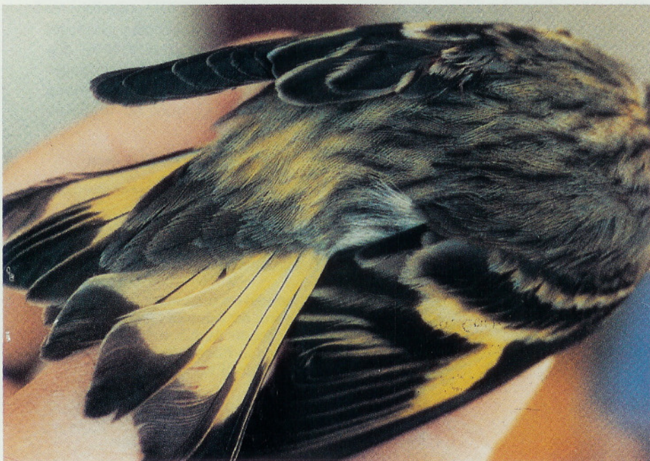
Figure 3. Dorsal view of the green-morph Pine Siskin captured in Arcata, CA, in late February 1987. Note the whitish fringes of the lesser and greater wing coverts, the latter underlain by extensive deep yellow of the bases of flight feathers.

no record to the effect that this species has become naturalized," and the A.O.U. Check-list (A.O.U. 1983) also mentions its unsuccessful introduction in Ohio. Tables 1 and 2 summarize all published North American reports known to us of Eurasian Siskins, excluding the two unsuccessful introductions. We are also aware of some other unpublished sightings of purported females; we regard these as unsatisfactory.