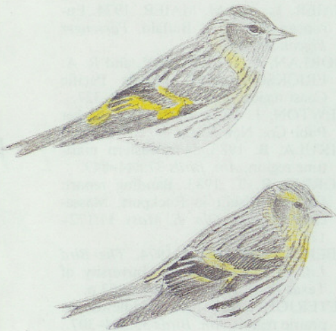
Figure 9. Sketch by Lars Jonsson of the green-morph Pine Siskin in Halifax, Nova Scotia, based on photographs (upper figure), together with that of a "typical" or composite adult female Eurasian Siskin (lower figure). Note the following features on the Eurasian Siskin: more distinct upper wing bar; broader and whiter lower wing bar; less prominent wing flashes (bases of secondaries); dark streaks on undersides most prominent on flanks; less contrasting ear coverts (not always so); stouter and more curved (not always) culmen.

skull in the latter. Therefore, length was measured from the anterior edge of the nostril to the tip of the bill. This averaged significantly greater ( t = 4.06 , d.f. 20, p < 0.01 ) in Pine Siskins (mean 8.88, S.D. 0.36, range 8.5–9.7 mm) than in Eurasian Siskin (mean 8.36, S.D. 0.26, range 7.9–9.0 mm). Bill depth, however, was significantly smaller ( t = 9.36 , d.f. 20, p < 0.001 ) in Pine Siskins (mean 5.80 mm, S.D. 0.29, range 5.3–6.4 mm) than in Eurasian Siskins (mean 6.31, S.D. 0.23, range 6.1–6.8 mm). Although these