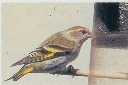
Figure 6. A gray-morph Pine Siskin in Halifax, Nova Scotia, late April 1986. Note that the yellow on wings and tail is extensive, but not strong in hue and that the back is only faintly greenish.

The green morph occurs largely or entirely in male Pine Siskins. All the strikingly dark green birds in the museum collections examined by us are males. This sex bias may be the basis for Blake's (1976) supposition that they represent "cock-feathered" rather than the normal "hen-feathered male." They are very drab compared to males of other cardueline finches,