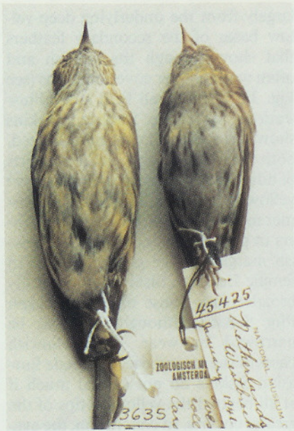
Figure 10. Ventral view of specimens of a green-morph Pine Siskin (NMC 83635, left) and a female Eurasian Siskin (NMC 45425, right). Note the extensive yellowish on the underparts of the former and its confinement to the upper breast on the latter.

The undertail coverts of most green-morph Pine Siskins (including both the Halifax and Arcata birds) are yellowish, a feature not found on any specimens of female Eurasian Siskins, some of which do have a little yellow immediately behind the legs. However, yellow undertail coverts are not always noticeable on specimens of green-morph Pine Siskins. Thus, yellow undertail coverts, if they can be seen, exclude the Eurasian Siskin; but their absence does not infallibly signify this species.