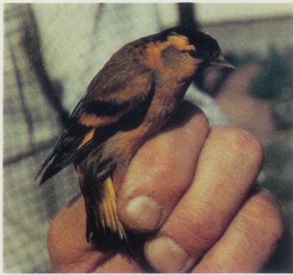
Figure 5. A male Eurasian Siskin captured at the Norris banding station (Norris 1983) at Rockport, MA, May 5, 1983.

distinguished from S. pinus ". Blake (1976), writing on the sighting in 1973 in Wisconsin (see Table 2), states: "What is not apparently generally known is that, although the Pine Siskin usually has hen-feathered males, once in a very long time it produces a cock-feathered male." Such males, which in terms of other siskin species are more female-like, are here referred to as green morphs, although the plumage appears to be restricted to males. Ryan (1981) warns about "aberrant