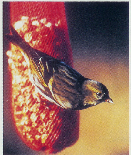
Figure 7. A female Eurasian Siskin in Coventry, England, February 1982. Note the paler yellow wing markings compared to the green-morph Pine Siskin (Figs. 1–4).

Bill size and shape. The Halifax bird had a deep bill compared with most Pine Siskins (cf. Figs. 2 and 8). Bill measurements by McLaren may be more comparable inter se than those from the literature. Five female and seven male Eurasian Siskins from Europe (others were broken or gaping) in the ROM were compared with six male and six female Pine Siskins chosen at random. Although the bills of the Pine Siskins appeared longer, their exposed culmen length proved very similar to that of the Eurasian Siskins, perhaps because of greater extension of the culmen onto the roof of the