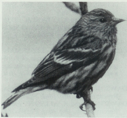
Figure 8. A first-winter Pine Siskin in Halifax, Nova Scotia, late April 1986. Note the thin bill (compare with Fig. 7).

skull in the latter. Therefore, length was measured from the anterior edge of the nostril to the tip of the bill. This averaged significantly greater ( t = 4.06 , d.f. 20, p < 0.01 ) in Pine Siskins (mean 8.88, S.D. 0.36, range 8.5–9.7 mm) than in Eurasian Siskin (mean 8.36, S.D. 0.26, range 7.9–9.0 mm). Bill depth, however, was significantly smaller ( t = 9.36 , d.f. 20, p < 0.001 ) in Pine Siskins (mean 5.80 mm, S.D. 0.29, range 5.3–6.4 mm) than in Eurasian Siskins (mean 6.31, S.D. 0.23, range 6.1–6.8 mm). Although these