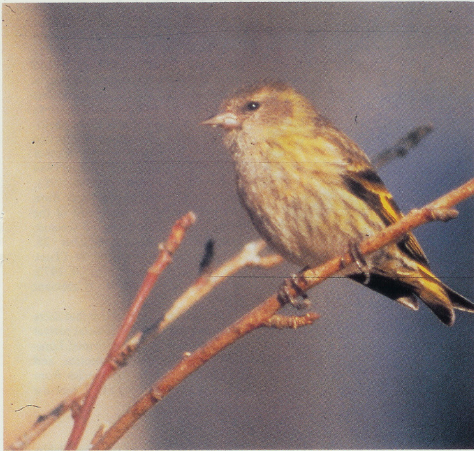
Figure 2. Ventral view of the green-morph Pine Siskin in Halifax, Nova Scotia, early April 1986. Note the extensively deep-yellow tail patches and yellowish on undertail coverts.