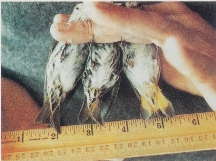
Figure 4. Ventral view of the green-morph Pine Siskin (right), together with two normally plumaged individuals, captured at Arcata, CA, in late February 1987. Note the extensively yellow rectrices and undertail coverts of the green-morph bird.

coastal Europe and the British Isles in fall (September to November), returning in spring (March to May). A major influx occurred in England and Ireland during winter 1985–1986 (Dawson and Allsopp 1986a; Dawson and Allsopp 1986b). However, banding recoveries indicate that most of these birds came from Scotland rather than Scandinavia (R. Hudson, British Trust for Ornithology, in lit.). As with other irruptive species, banding data suggest that the Eurasian Siskin neither breeds nor winters at the same location in successive years. In fact no