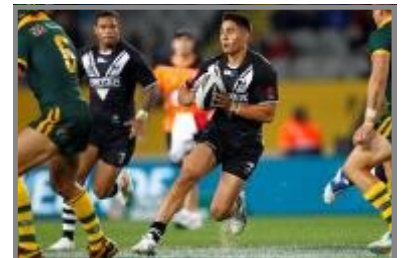
Kiwis v Kangaroos VB Test Match Page 7