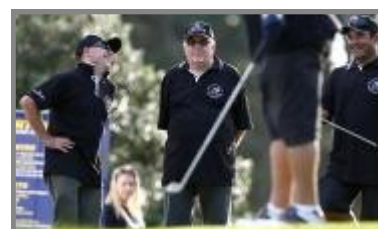
League 4 Life Golf Day Raises Funds for Foundation Page 4