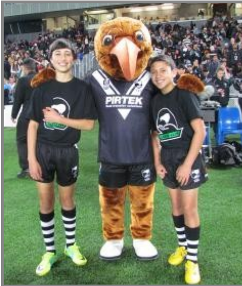
The new Kiwis Mascot made its debut at the test match.