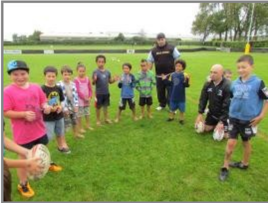
Children get stuck in to the activities, passing the ball, building their strength and smiles in a tug of war, tucking into breakfast & finishing with a big shout out to celebrate the morning.