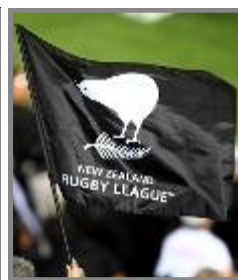
Kiwi fans went all out to show their support, painting their faces, making signs & costumes. Even touring band One Direction (middle left) came along for a look.