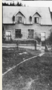
Photos from top: Original Church, Lutheran Church 1905, Moutere Inn, Wypersfontein.