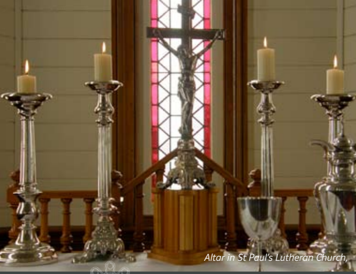
Altar in St Paul's Lutheran Church,