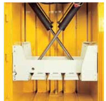
The cross cylinders ensure stable compression and a low overall height.