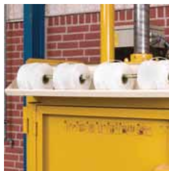
The strap rolls are easy to replace in front of the machine.