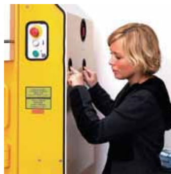
The bale is ejected by a safe two-hand operation.