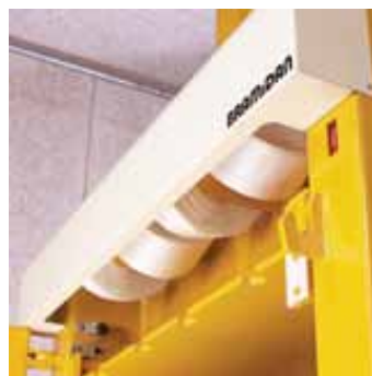
Strap rolls are easy to replace in front of the machine.