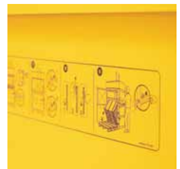
All balers are equipped with easily understood pictograms.