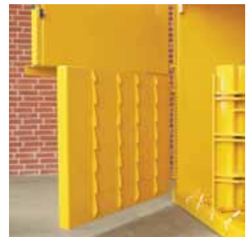
Rows of barbs inside the chamber keep the waste material down.