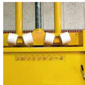
Strap rolls are easy to replace in front of the machine.