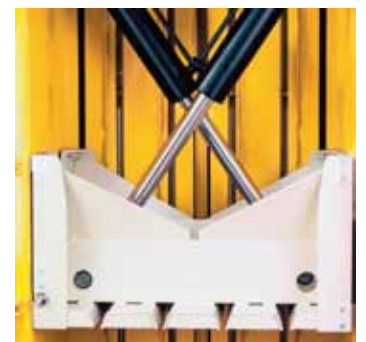
The cross cylinders ensure stable compression and a low overall height.