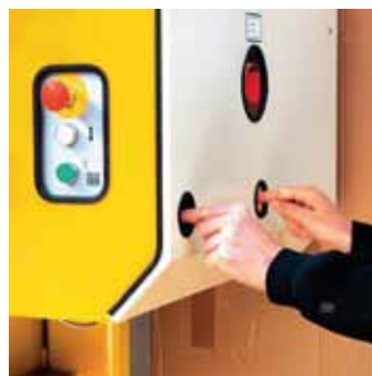
The bale is ejected by a safe two-hand operation.