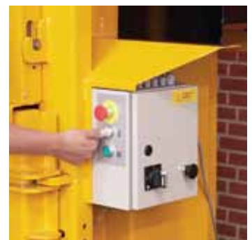
The machine has a simple control panel.