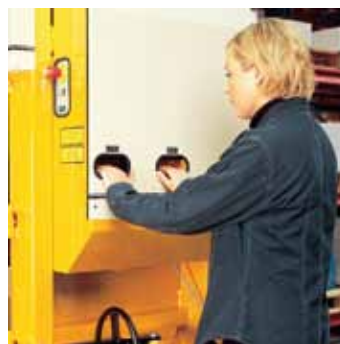
The bale is ejected by a safe two-hand operation.