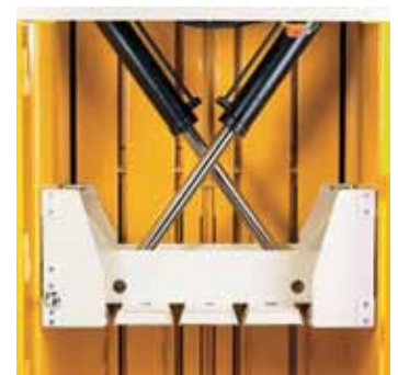
The cross cylinders ensure stable compression and a low overall height.