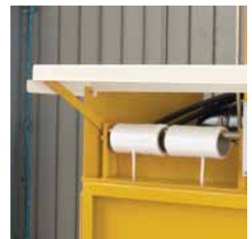
The strap rolls are easy to replace in front of the machine.