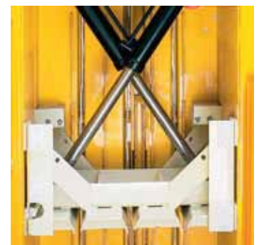
The cross cylinders ensure stable compression and a low overall height.