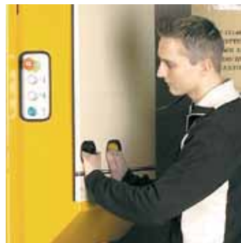
The bale is ejected by a safe two-hand operation.