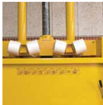
Strap rolls are easy to replace in front of the machine.